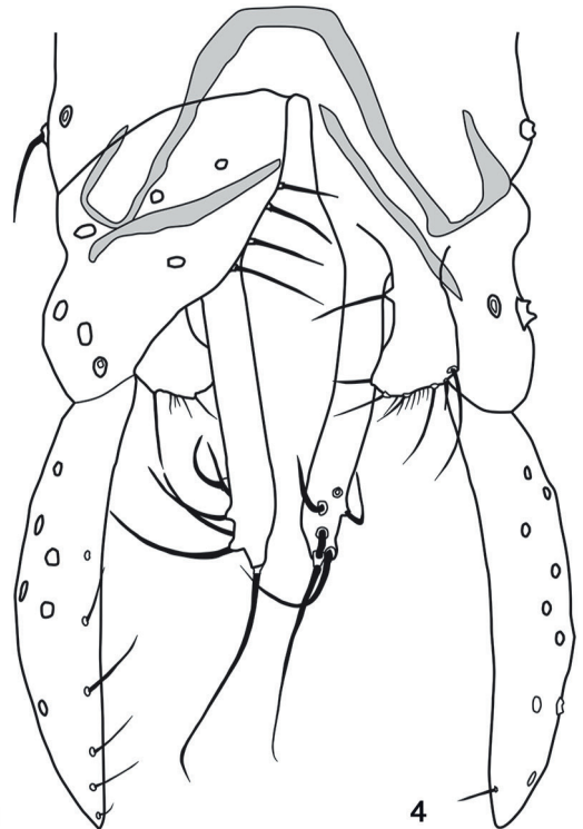
Figs. 1 - 4. Polypedilum (Tripodura) quinquasetosum (Edwards). Male imago. 1, wing; 2, tibial scale of fore leg; 3, hypopygium, dorsal view; 4, hypopygium with tergite IX removed, right, dorsal view, left, ventral view. Scale bar= 100 \mu m, except in Fig. 2.