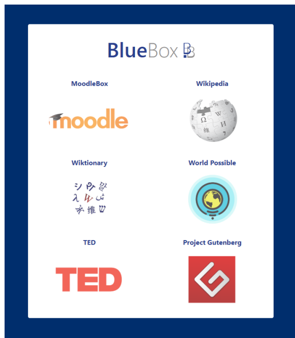
Figure 1: The BlueBox Homepage

library” approach builds upon the work of Mitra et al. 9 who examined the use of a computer located in a wall by rural children and was highlighted in the recent TED talk. 10 The BlueBox Project is currently developing additional partnerships to help facilitate the development of videos and courses on applied topics such as health and hygiene, entrepreneurship basics, safety training videos, and virtual experiences related to the local culture and environment. A key component of The BlueBox Project is a research program designed to examine what educational resources are used at a site in an effort to better serve the users in the future. Our ongoing research examines the characteristics of site-level usage based on the demographic (school grades, urban vs. rural, etc.) and economic characteristics of a location. These statistics will enable us to update the existing devices, provide more applicable materials on devices hosted by new schools and other sites, and encourage our partners to develop additional materials that meet the needs and interests of a given demographic.