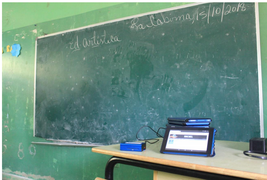
A classroom from a BlueBox site in the Dominican Republic

The BlueBox seeks to provide materials of both academic (elementary and high school) and applied nature. The use of electronic resources, often accessed via tablets, 1 have been shown to improve outcomes in educational environments in developing countries where many schools lack classroom texts and other reference books. 2 The BlueBox Project currently provides site-specific, local language content for partner schools based on school demographics. The typical BlueBox contains 128GB of educational resources that includes open-source textbooks, Khan Academy videos (tutorial videos in math, science, and many other subjects), Wikipedia for Education, Project Gutenberg (thousands of books), RACHEL and OER2Go materials from World Possible (educational games, reading, music, and much more), and the learning management system Moodle (locally designed online courses and training). 3 In the case of one high school, a BlueBox with foreign language content was provided at the request of foreign language teachers. The BlueBox Project is also working with several partners to facilitate the translation of open educational resources into additional local languages. Additional information on The BlueBox Project can be found at http://bluebox.creighton.edu/ . Our numerous conversations with teachers and community leaders have confirmed the findings of a recent survey by The Pew Center 4 that there is a strong