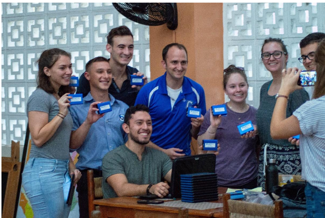
BlueBox preparations in the Dominican Republic

We proceeded to the Dominican-Haitian border for the remainder of our trip where students visited several sites and organizations that highlight the disparity in income between the two countries that share the same island. Students were also able to experience Market Day where Haitians would cross the border to sell products such as food, clothing, toiletries, trinkets, toys, etc. and buy goods produced in the Dominican Republic. This further indicated the extreme poverty and resulted in a wide array of emotions (e.g., sadness, anger, and guilt). Many students indicated that they wanted to help but had no idea where to start. However, the delivery of BlueBoxes to a Jesuit organization, visits to organizations assisting those in need, and further reflections reinvigorated the belief that small steps can inspire hope. Additionally, while visiting with one organization, we were able to foster a relationship to begin translating some open-access educational materials from Spanish to Haitian Creole.