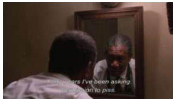
Screenshot 10. Routinization as the grounding of social life

In Red's case, although the role of structure was so strong, helped by Andy's agency, Red's agency appeared as he finally chose not to buy a gun and committed a crime again to be sent back to the prison. His consciousness and purposiveness enabled him to break loose from the grip of prison structure. This example shows again the interplay of Red's agency vis-a-vis prison structure.