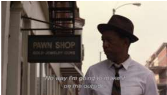
Screenshot 5. Prison structure’s grip on Red after 40 years of being institutionalized

that hope was a good thing, and no good thing could ever die. Finally, Red made the choice to go and meet Andy, otherwise he would have ended up in prison all his life. In the room where Brooks carved on the wall “Brooks was here”, before committing suicide, Red also carved a similar sentence next to it “so was Red”, making a different choice to keep up living outside prison although the conclusion was unclear to him at that point (Screenshot 6).