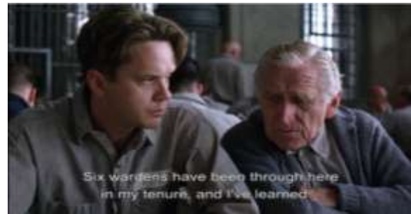
One immutable, universal truth: Not one of them ... wouldn't pucker up tighter than a snare drum when you asked for funds.

The second example of Andy's agency was when Andy asked for some fund to add the book collections of prison library from Warden Norton. Of course, changing the structure in the prison regarding the library could be said to be impossible. Based on Brooks' experience (the inmate librarian) who had been imprisoned for more than 50 years and who had experienced six times of warden change, the request for fund to add the library book collections was never granted (Screenshot 3). However, with Andy's resource of financial and tax knowledge, which finally made Warden Norton also ask Andy for financial advice, Andy was allowed to write a letter to the Senate once every week (Screenshot 4). After 6 years of sending letters without break, Andy's request was granted. From the three-layered structure, it can be seen that Andy employs the resource of his relationship (facility) with the warden to get a permission to write letters to the Senate (domination) and the modality he applies to communicate is an interpretive scheme of "education" which finally gives power to him to get what he wants.