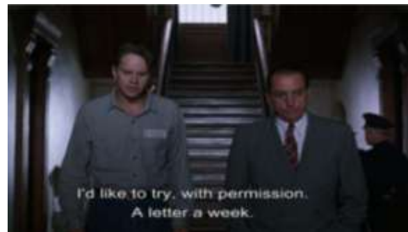
Screenshot 4. Strong structure and agent's negotiation with Warden Norton

As Warden Norton himself said that there were only three ways to spend the taxpayers' money for prison, namely for more walls, more bars, and more guards, which meant that a request for more books was impossible. However, through his agency, Andy tried to negotiate with the Warden to get a permission to write letters. Actually, Warden Norton gave Andy a permission to write letters only to make him happy, but finally Andy's request was granted. This example shows that Andy's agency can change a part of the prison structure regarding the library although he needs to negotiate with the warden (representing the structure) to get the permission to write the letters. Thus, it shows that there is an interplay of Andy's agency and the prison structure.