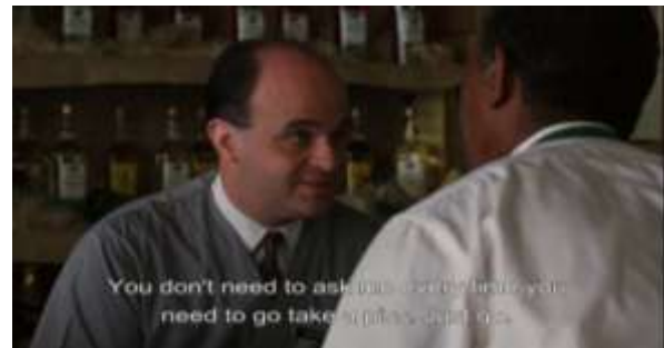
Screenshot 9. Institutionalization of structure

manager (which bothered him) and he said: "You don't need to ask me every time you need to go take a piss. Just go" (Screenshot 8). This was exactly what Giddens (1986) said about the basic requirement of social systems: "The structural properties of social systems exist only in so far as forms of social conduct are reproduced chronically across time and space. The structuration of institutions can be understood in terms of how it comes about that social activities become 'stretched' across wide spans of time-space" (p. xxi). Further he said that the "fundamental concept of structuration theory" is routinization (p. xxiii). This is what Red experienced, which he called as being "institutionalized" for forty years (Screenshot 9).