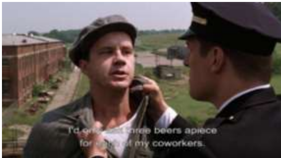
Screenshot 1. Andy's agency and the risk of being pushed off the roof

inmates respected and supported Andy, even the prison guards protected him from being bullied by Bogs (a fierce inmate) and his gangs. This example shows that even though Andy's agency can make a change on the relation of the inmates with the guards and among the inmates, it still needs the approval of Captain Hadley to accept Andy's offer and to grant his request. This shows an interlocking relation between agency and structure.