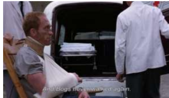
Screenshot 11. The effect of structure of domination to Boggs

Although prison structure looked dominant in the form of rules, it could also be seen as resources at the same time. This was clear from what Andy did by making use of his knowledge as a banker to give financial advice to almost all prison guards including Warden Norton.