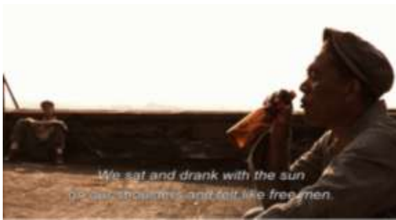
Screenshot 2. Andy's agency created a different atmosphere

The second example of Andy's agency was when Andy asked for some fund to add the book collections of prison library from Warden Norton. Of course, changing the structure in the prison regarding the library could be said to be impossible. Based on Brooks' experience (the inmate librarian) who had been imprisoned for more than 50 years and who had experienced six times of warden change, the request for fund to add the library book collections was never granted (Screenshot 3). However, with Andy's resource of financial and tax knowledge, which finally made Warden Norton also ask Andy for financial advice, Andy was allowed to write a letter to the Senate once every week (Screenshot 4). After 6 years of sending letters without break, Andy's request was granted. From the three-layered structure, it can be seen that Andy employs the resource of his relationship (facility) with the warden to get a permission to write letters to the Senate (domination) and the modality he applies to communicate is an interpretive scheme of "education" which finally gives power to him to get what he wants.