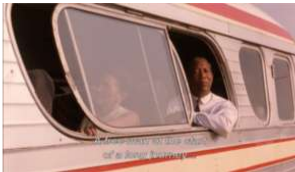
Screenshot 6. An inmate broke loose of prison structure’s grip to start living a new life

The next example of Andy’s agency can be seen after Andy got donations of books and some gramophone records and he played a record in the prison guard’s office. Music in Shawshank prison was never heard, and Andy played the record and put it on the prison loudspeaker. It gave a stunning effect to all inmates as if it were a miracle for them (Screenshot 7), and it drove all the guards and Warden Norton furious. In this example, Andy’s agency undermined the prison structure by doing something that was never done before. Furthermore, Andy played the record without asking permission from the guard or Warden Norton (who had power to determine what was accepted or what was not). Indeed, Andy’s agency could make a change in prison, but it was only for a while. Nevertheless, it was not only a fancy change of habit in prison, but it gave such a profound impact to the inmates that Red made the following statement, “And for the briefest of moments, every last man at Shawshank felt free.” However, Andy’s action resulted