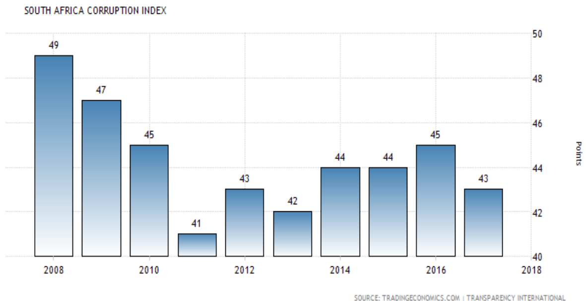
Table 1: South Africa Corruption Index 2008–2018

The challenge of South Africa as a country battling with combating corruption and related corrupt activities is further highlighted in the scores and the ranking the country obtain in corruption perception index (CPI) of Transparency International. The CPI reflects South Africa as a country besieged by corruption and corrupt practices. For instance, South Africa scored 43 points out of 100 on the 2017 CPI.