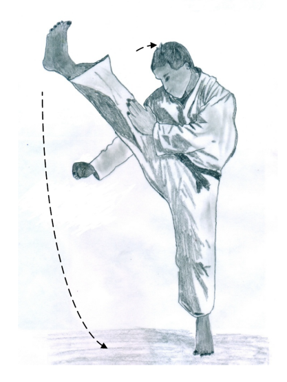
Figure 1. Axe kick execution during power load

To execute the axe kick, the fighter brings up his/her kicking leg in a linear/circular motion, and at the peak height, brings the heel or ball of the foot straight down (like a downward movement of an axe) (Figure 1) upon the opponent's head, shoulder or chest. Another use for the axe kick is to stop an incoming attack. The fighter can target an axe kick against the supporting thigh of an opponent in the initial stages of a kick.