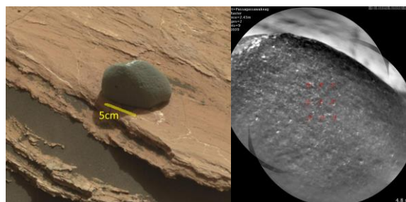
Figure 2. Ireson Hill float rock Passagassawakeag. This a dreikanter, suggesting that the sample may be a hard, crystalline rock. However, definitive textural origins are not evident. MCAM on left and ChemCam RMI on right, showing a 3x3 LIBS raster.

High resolution images of the Pogy float rock (Fig. 3) reveal an unusual texture with two visually distinct phases. A lighter toned phase makes up approximately 60% of Pogy's texture, and the darker toned phase approximately 20%, with the remainder being interstitial material without distinct grains. Both phases are anhedral, with grain sizes typically ranging from 1-1.5 mm. The texture appears largely crystalline. It appears notably dissimilar to the normal Stimson in situ and float (e.g. Perry, Fig. 1) rocks. Diagenetic processes may have cemented a more massive horizon in the Stimson capping unit, although the compositions (see below) do not suggest a high state of hydration. In other parts of the Stimson unit in Gale, silica-rich fluids have exploited fractures [4] but that is not seen at Ireson Hill. A possible alternative explanation is that Pogy is an igneous, plutonic rock, with an uncertain emplacement process at Ireson Hill.