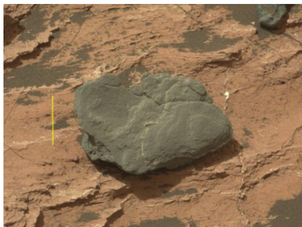
Figure 1. MastCam image of Perry float rock on Ireson Hill. Scale bar = 3cm. The rock shows sedimentary grains across its surface, as well as a thin bedding structure visible on the lower right-hand segment of the rock. This likely a fragment of the Stimson capping unit.

Float Rock Textures: One float rock, Perry (Fig. 1) is clearly clastic sedimentary in origin. Other Ireson Hill samples have well defined Dreikanter morphologies e.g. Passagassawakeag, which hints at a harder, crystalline mineralogy (Fig. 2).