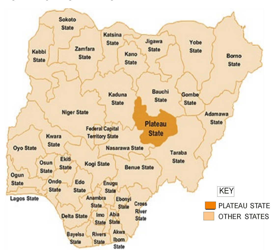
Figure 2: Map of Nigeria Showing Plateau State