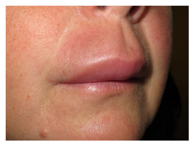
Figure 2 - Lip angioedema in a patient with chronic spontaneous urticaria.