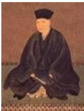
Sen no Rikyu (1522~91)

This poem describes lonely scenery at the sea shore in the autumn without using any subjective literal expression, so that this poem is often considered to be the symbol of simple Japanese tea ceremony originated in Sen no Rikyu (1522~91). Refer to Appendix for the details.