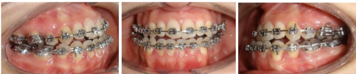
Figure 10. we opted for orthognathic surgery. Orthodontic treatment aimed to raise dental compensations with extraction: 14.24.34.44.

Clinical examination revealed anterior crossbite with a deviation of the median incisors on the right side