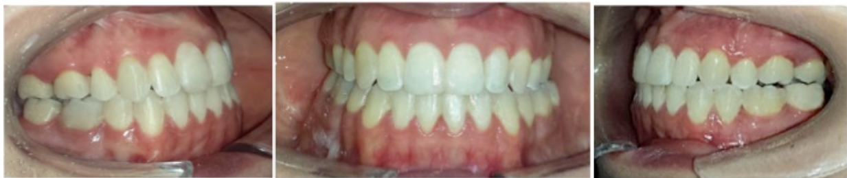
Figure 13. After 26 months, we were able to obtain a satisfactory aesthetic and functional result