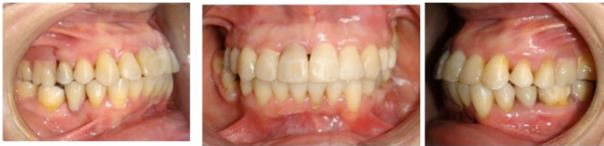
Figure 8. Orthodontic treatment was to correct malpositions and dental rotations and creates spaces for future prostheses. A provisional prosthesis was performed until achieve dental implants