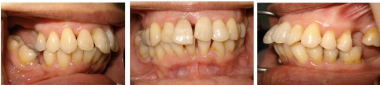
Figure 7. A patient aged 50years addressed for orthodontic treatment for future prosthetic rehabilitation.