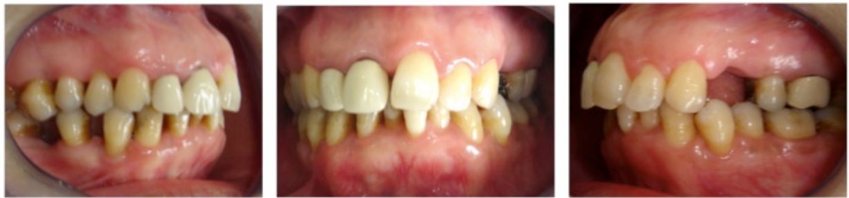
Figure 5. Clinical examination in this patient showed defective prostheses with poor periodontal status.