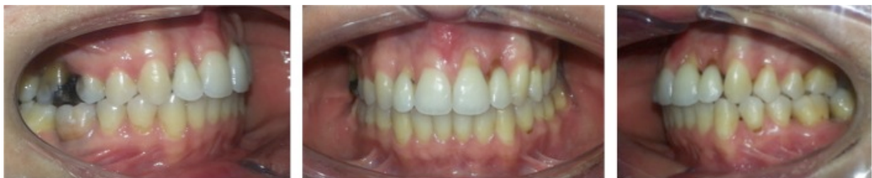
Figure 2. Orthodontic treatment consisted of an alignment and correction crowding, the patient was sent after removal of the orthodontic appliance to the periodontist for a gingival graft to cover gingival recession