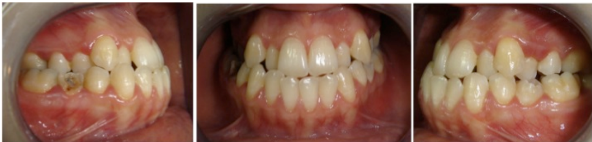
Figure 9. A patient aged 23 years presented to an aesthetic pattern with a skeletal Class III with facial asymmetry.

Clinical examination revealed anterior crossbite with a deviation of the median incisors on the right side