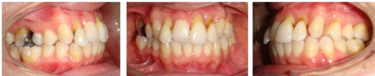
Figure 1. A young woman aged 20 years and the reason for consultation was gingival recession and dental crowding