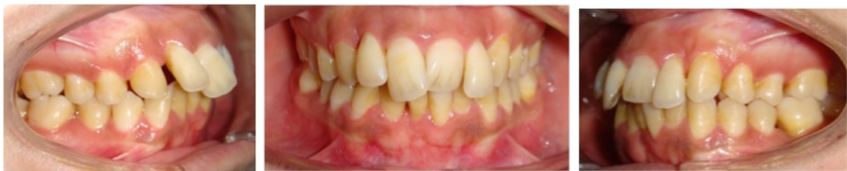
Figure 3. A patient who consults for malpositions and dental extrusions