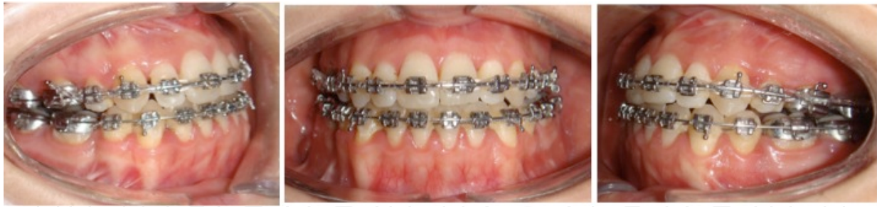
Figure 12. Some months after the surgery, orthodontic treatment is to install a good occlusion