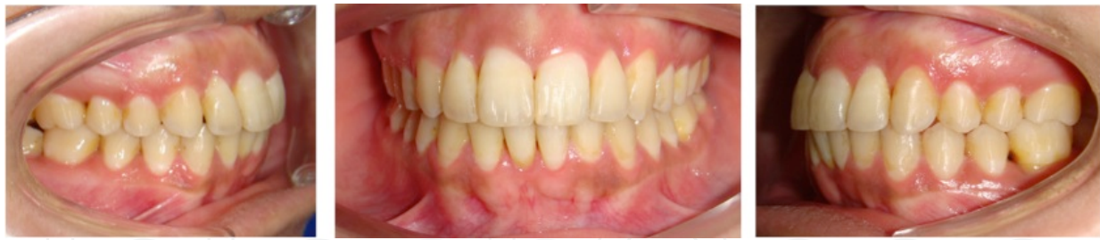
Figure 4. Orthodontic treatment was aimed at correcting dental malposition and regain proper alignment will facilitate the oral hygiene.