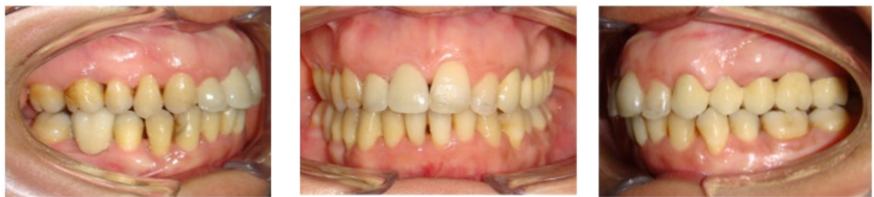
Figure 6. Orthodontic treatment was performed to correct the malocclusion. The patient also received a prosthetic rehabilitation.