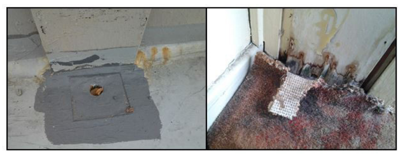
Figure 3: Roof and RWDP Failure Cause Timber Column Damage, Moisture and Mould Growth at Library

Library B had an experience of the failure of rainwater downpipe and flat roof system. The improper maintenance work such as clear out the dry leaves and debris slow the rainwater get through the pipe. The dry leaves and debris in the area of flat roof gutter is not been cleared and start to block the drain especially during heavy rain. These should be cleared out during a regular maintenance schedule. Therefore the water intrusion from the rainwater downpipe (RWDP) in the timber column contributed moisture inside this library as shown in Figure 3 below.