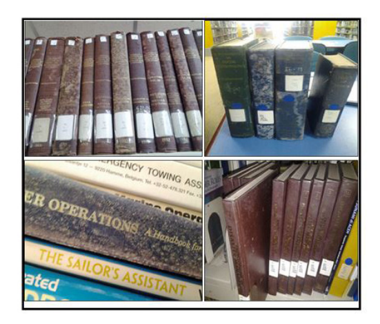
Figure 4: Mould Growth on the Binder Books in the Libraries

From the visual inspection of the three case studies, it found that some of the books on the book rack especially at crawls area are identifying with mould symptom on the book cover such fuzzy spot or powdery. This condition due to the area of crawling spaces got less of light, exposed to dust and humid. The relative humidity condition at 61% to 80% was one of the factors that contributed to the humid in the ambient and therefore mould growth at a certain area in this three libraries. It also due to the books immobile or recess at the same place and didn't get decent airflow. The mould growth on the books cover is shown in figure 4 below.