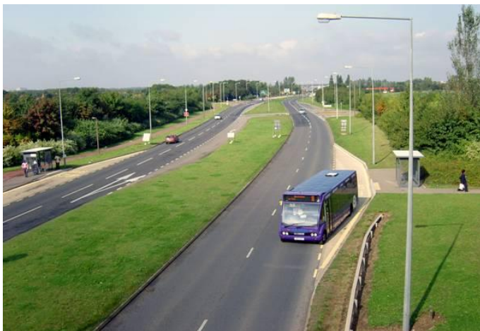
Figure 5: Road and bus stop in Milton Keynes. Remote bus stops, a dispersed land use pattern and high capacity roads mean that Milton Keynes has a poor bus service and motorists have little option but to drive everywhere.

There is a final stage in public transport integration, which brings us back to the physical planning aspect considered at the beginning of this paper. Locational integration is a micro-level planning issue, but there is also a macro land use design level which is about integration the planning of transport with the generators of travel. The latter involves planning decisions regarding the location of major travel-generating land uses, particularly workplaces, shopping, schools and leisure facilities. Locating such land uses along public transport corridors allows for the development of effective interchange hubs and will also build up demand and service frequency/quality. However there is a major urban design issue in that more dispersed and sprawling settlement patterns work better for car access. Such designs characteristically have poor public transport and offer little choice to car users to travel in a more sustainable manner (Potter, 2008). Such high-level integration is vital in order for the other forms of integration to be achieved. With a major amount of new urban development planned over the next 20 years, building these settlements to designs that provide viable alternatives to car use is a crucial challenge.