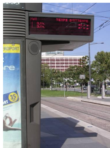
Figure 4: Real time display at a Strasbourg Tram stop

next bus arrives), in train and bus displays of the route and stops, announcements of the next station and expected arrival time. Simple effective signposting and guidance around interchanges is also important.