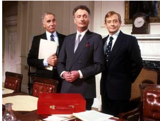
Figure 1: Scene from 'Yes Minister'

In consequence it is possibly not surprising that one of the earliest uses of the phrase "Integrated Transport Policy" was not in a government policy or a transport research document, but in the 1981 BBC Television political comedy Yes Minister . In an episode entitled 'The Bed of Nails', (Lynn and Jay, 1981) an Integrated Transport Policy is proposed. The main problem is finding a sufficiently gullible minister to front such a politically thankless task with so many risks and little potential for immediate reward. Thus a buck-passing plot unfolds with, eventually, the Integrated Transport Policy being shelved in a return to the party's core approach to transport of "our policy is not to have a policy".