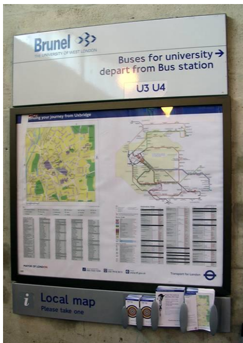
Figure 3: Example of at-station interchange information at Uxbridge Underground Station in London. This includes a local map (with takaway versions) and bus connections. The Bus station is located next to the Underground station.

In London, at-station interchange information provides poster displays of bus services from the station, the location of bus stops and a street map of the area within about a 5 minutes walk. As part of this, the system of colour coding of routes, used extensively on metros, is used for bus routes (See Figure 3). UK Mainline rail stations are now starting to follow suit and the colour coding of bus routes and use of easily-understood diagrammatic maps is becoming widespread.