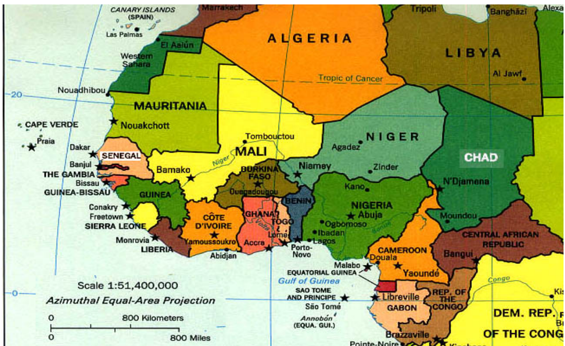
Figur 2. Ghana and Liberia on a West Africa map

http://everythingpossible.files.wordpress.com/2008/03/map-west-africa.jpg (Accessed 20.03.09)