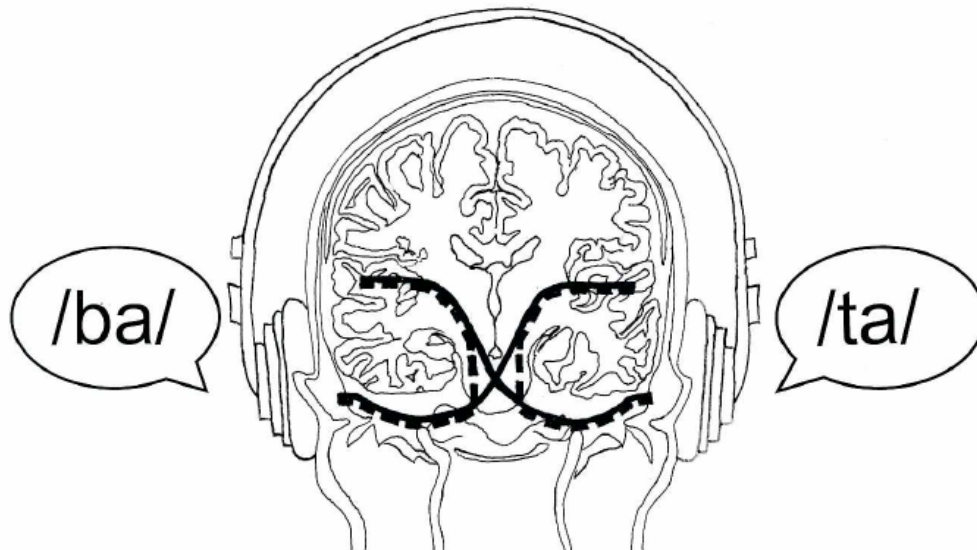
Fig. 2. Overview of the dichotic listening situation used in this thesis. CV-syllables (/ba/, /ta/) are given simultaneously to each ear by earphones. Due to the preponderance of the contralateral neuronal pathways and the blocking of the ipsilateral pathways, the right ear signal is directly fed to the left hemisphere, where signal processing is done.

Dichotic listening consists of simultaneous presentation of different auditory stimuli to the left and right ears. Often, some kind of selection is made by the subject taking the test, and the percentage of correct reports from each ear is noted. A very wide range of stimuli and scoring procedures has been used. Normally, a right ear advantage (REA) for verbal stimuli and a left ear advantage (LEA) for most nonverbal stimuli is found (Bryden, 1988). The findings of asymmetry, among other properties, make the test suitable for studies on brain laterality, and it has gained a prominent role in experimental brain research. There is a wide variety in methodology, and comparisons between studies can be difficult. Also within the verbal domain, stimulus properties may affect results. For example, Asbjørnsen and Bryden (1996) showed that performance with consonant-vowel (CV) syllables was easier affected in the