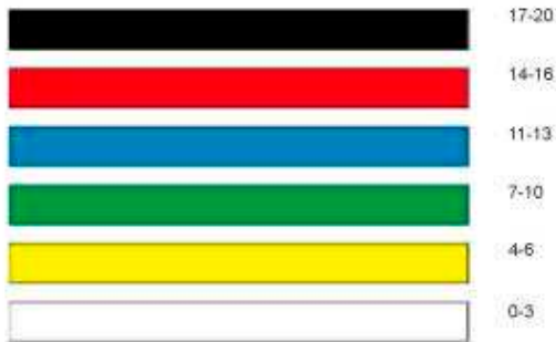
Figure 2 Fashion colour belt

A further two tables were designed to re-rank shops by location and branding and a set of portfolio charity shop cards were designed showing a photograph, the appropriate fashion colour belt and the name and location of the shop. The portfolio cards visually reflect the fashion performance of each shop and an example is given in Figure 3. Finally a new theoretical strategy framework was developed specifically for charity shops to upgrade towards an up-market fashion retailing concept termed the mannequin model.