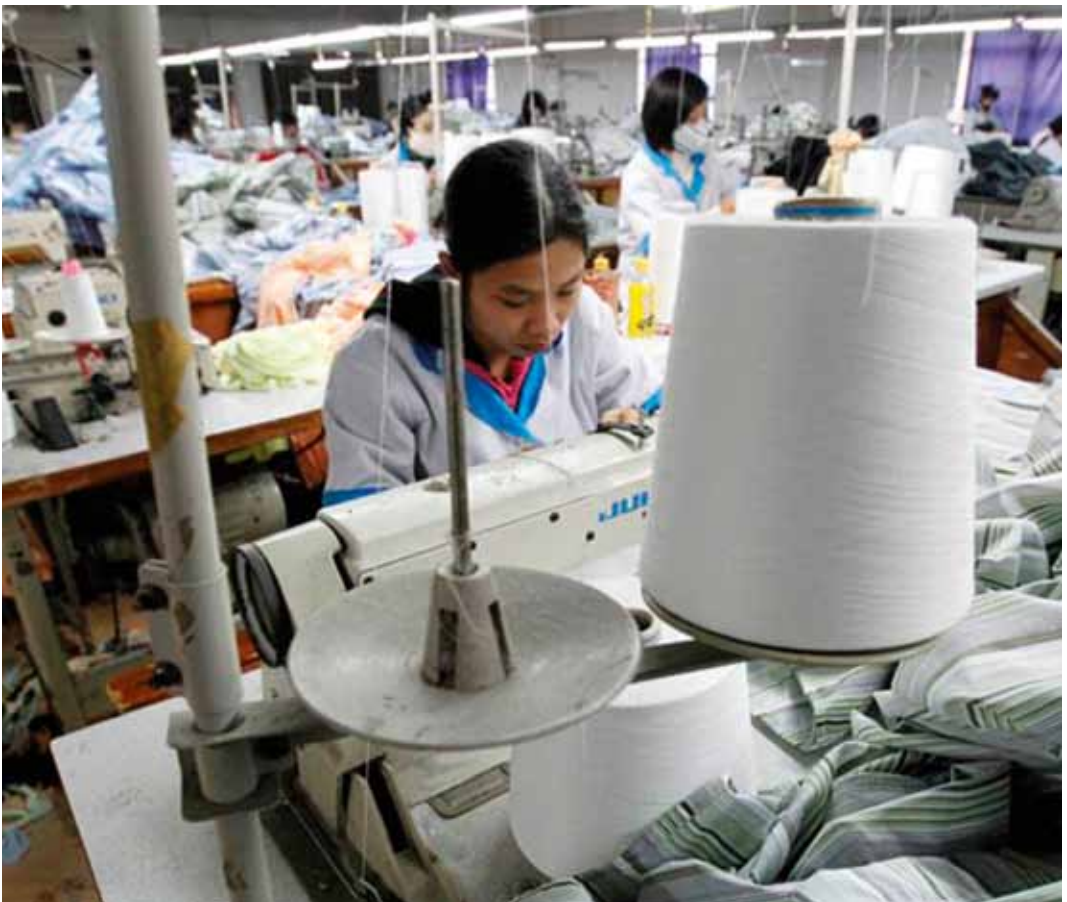
Labourers work at a garment factory south of Hanoi 4 January 2012. Vietnam's export of textiles and garments last year jumped 25% from 2010 to $14.03 billion, making it the biggest export item of the country.

Those changes in Vietnam's foreign policy and strategic outlook have helped mobilise valuable external resources to turn the country into an economic 'rising star'. Its GDP (at official exchange rates) has increased sevenfold since 1985 to US$103 billion in 2010 3 , bringing Vietnam into the ranks of low middle income countries. The relatively robust economic development over the past two decades has helped to reduce the poverty rate from around 60% in the late 1980s to 10.6% in 2011. Those socioeconomic achievements are undoubtedly the most important basis for the VCP's claim to legitimacy for its rule,