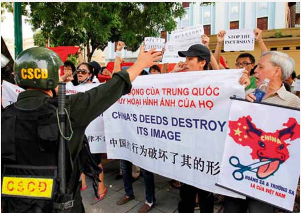
Protesters took to the street in Hanoi for a fifth consecutive Sunday on 3 July 2011 to rally against China's activities in the South China Sea

Meanwhile, China has been emerging as a global superpower. Although its impressive economic development has been praised as