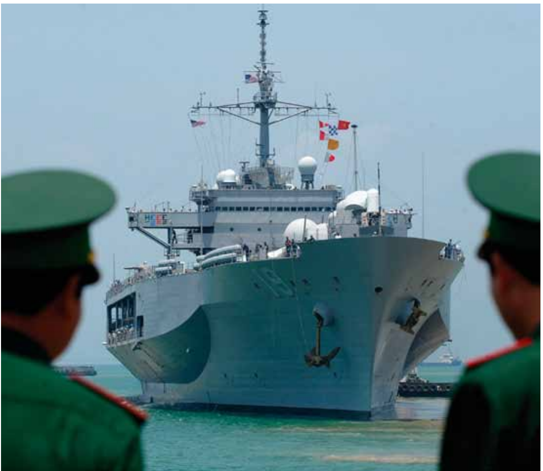
Vietnamese border guards watch the US Seventh Fleet's USS Blue Ridge entering Tien Sa port as Vietnam welcomes the port call of three US naval ships in Danang on 23 April 2012.

However, Vietnam's investment in its naval capabilities is still very modest compared with that of China, its main rival in the South China Sea. In 2011, while China's official military budget was $91.5 billion, Vietnam was reported to allocate only $2.6 billion to defence (about 2.5% of its GDP). Therefore,