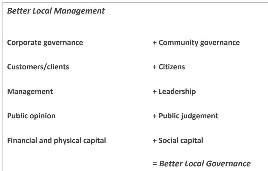
Figure 1: Sproats’ components of local governance reform

In Australia, an early discussion of local and community governance was provided by Sproats (1997) in a paper responding to regional planning issues in inner Sydney. Sproats argued that the ‘largely instrumental reform agenda’ of the time – focused on local government’s role as a service deliverer, efficiency and effectiveness in achieving outcomes, performance excellence and value for money – needed to be balanced by “engagement of an informed citizenry in collectively solving community problems” (ibid: 3). Better local management should thus be matched by better local governance, with greater emphasis on local people and social as well as physical and financial capital. Sproats applied Osborne and Gaebler’s (1993: 24) definition of community governance as “the process by which we collectively solve our problems and meet our society’s needs.” His ideas are summarized in Figure 1.