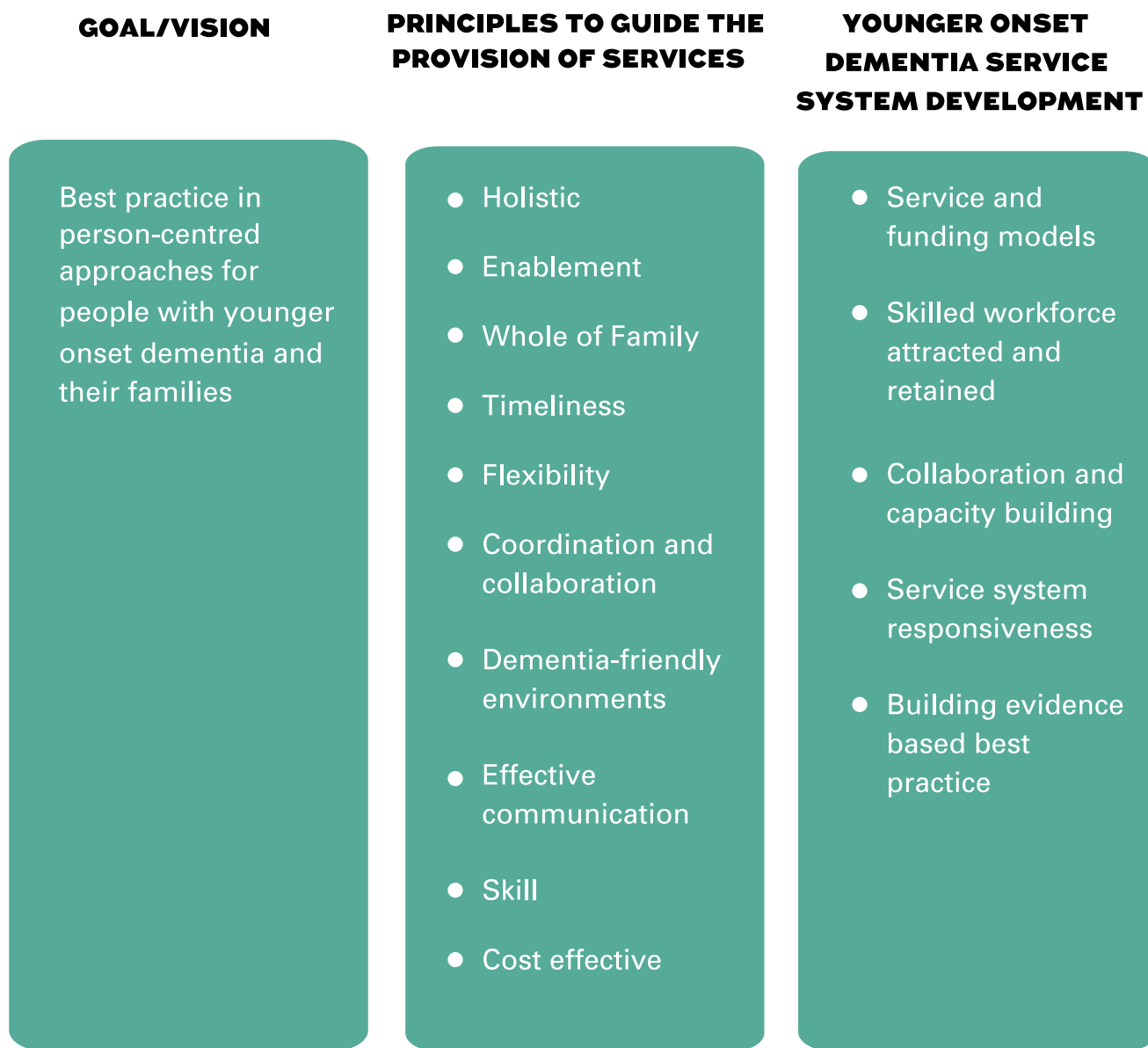
FIGURE 9: SUMMARY OF VISION, PRINCIPLES AND IMPLICATIONS FOR SERVICE SYSTEM DEVELOPMENT

This figure summarises the relationship between the vision for person-centred approaches for people with younger onset dementia, their families and carers; the principles to guide the provision of services; implications for service system development; and strategies to implement change, as outlined in Sections 7-9.