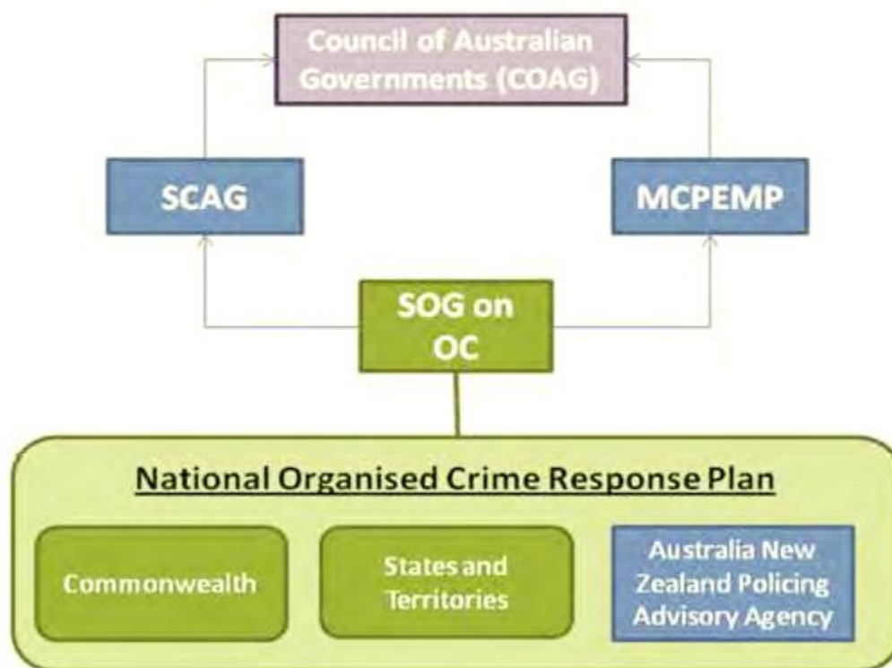
Figure 1: Reporting and governance structure: SOG on OC and the National Response Plan