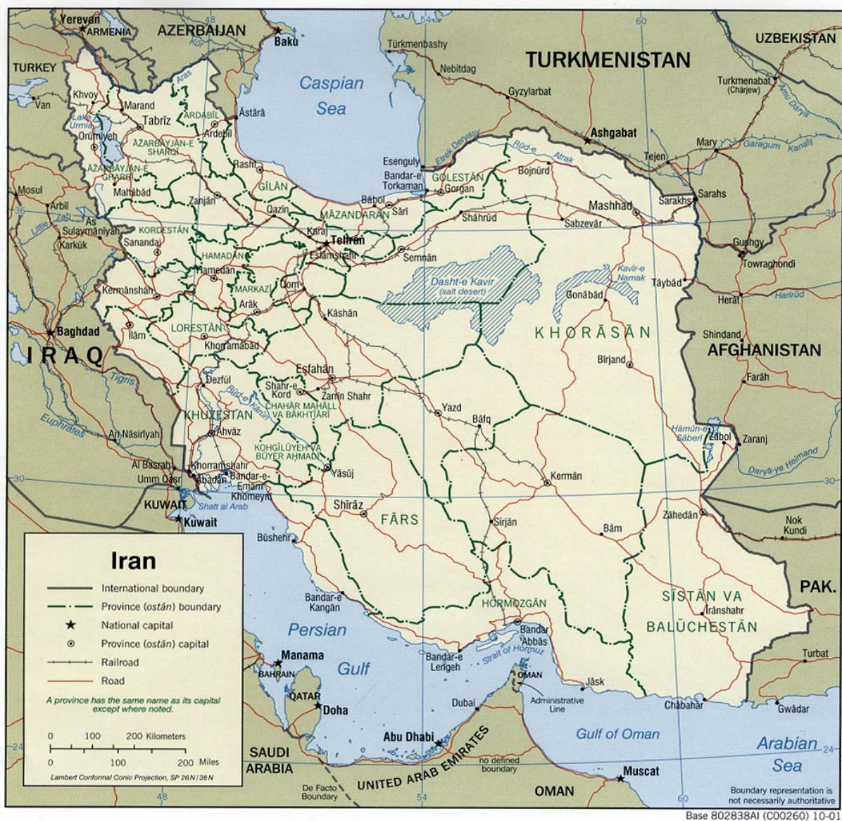
Figure 1: Map of Iran 1

The author would like to specially thank colleagues from the Parliamentary Library and independent reviewers for their valuable comments on the earlier versions of this paper.