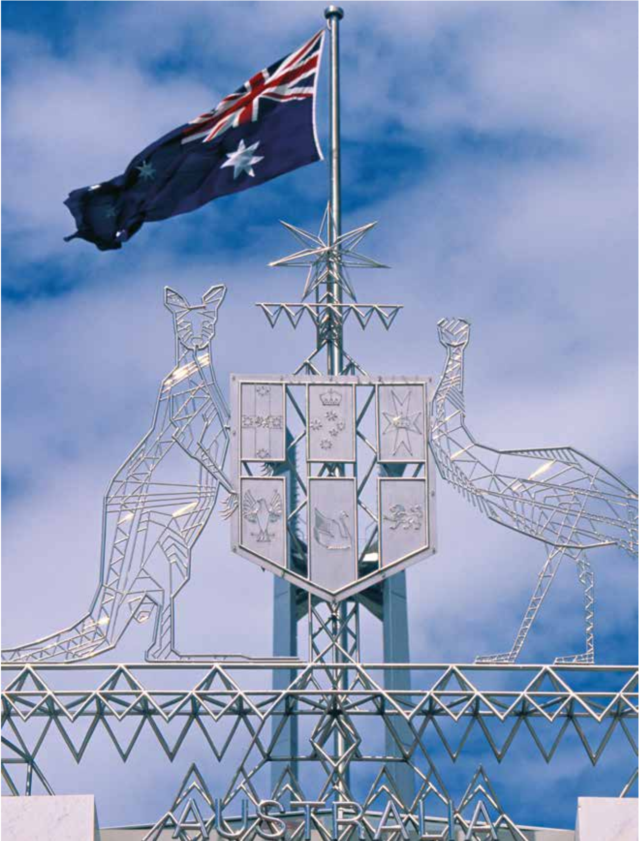
Parliament House, Canberra.