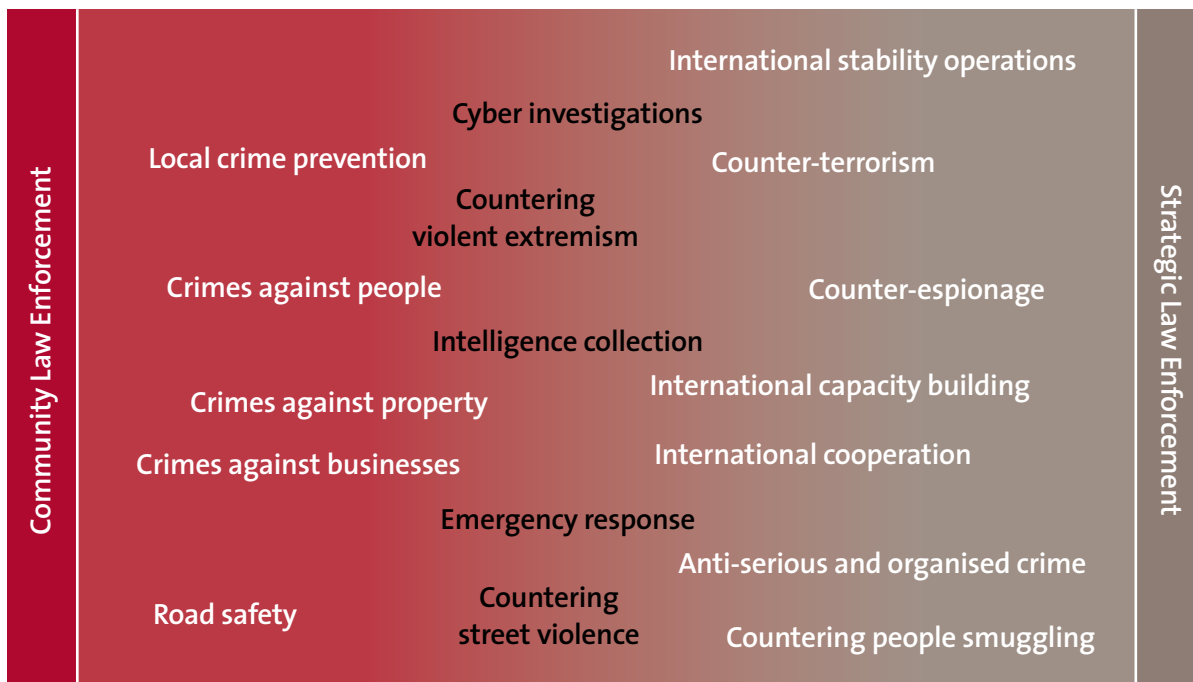
Figure 1: A continuum of law enforcement activity