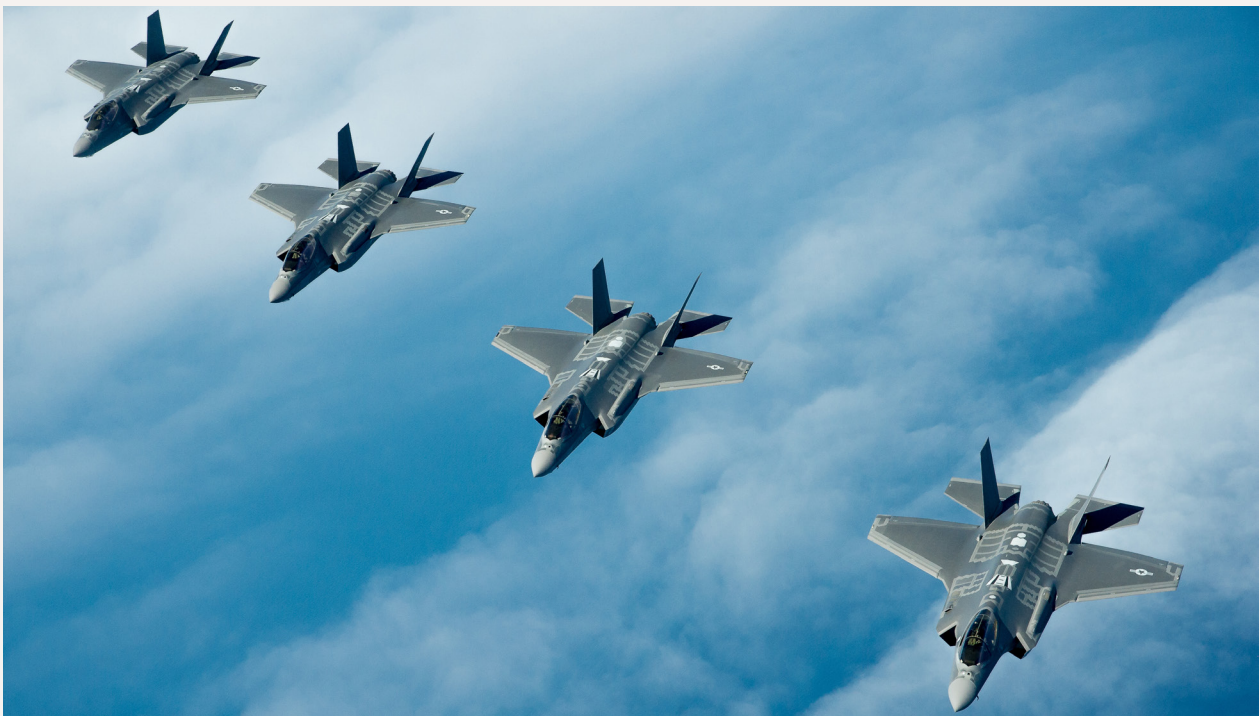
US Air Force F-35A Joint Strike Fighters from 58th Fighter Squadron, 33rd Fighter Wing over the northwest coast of Florida.

The ability to wield airpower effectively has been firmly established as a prerequisite for success at all levels of war fighting, especially the high-intensity end. And the capability to protect our air and maritime approaches is a core task for the ADF. The F-35 has been a part of that plan for over a decade and, after several false starts, we're now reaching the main decision point.