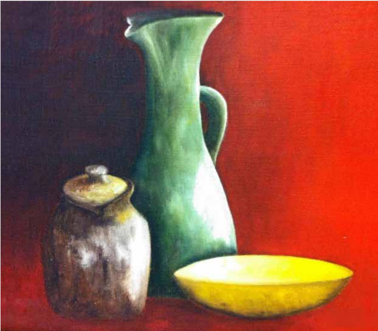
Still life painted by Norma