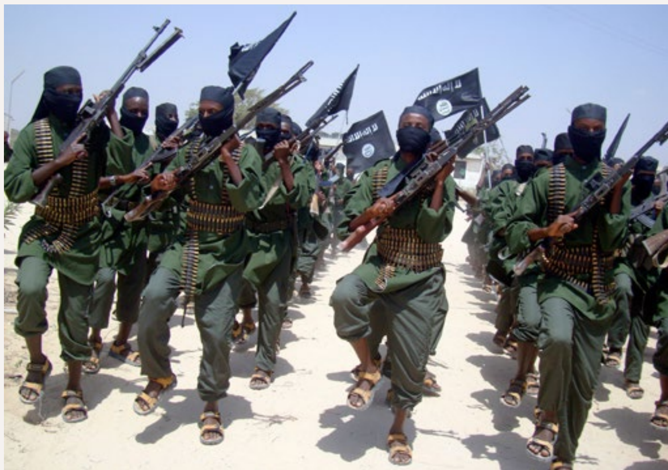
In this 17 February 2011 file photo, al-Shabab fighters march with their weapons during military exercises on the outskirts of Mogadishu, Somalia.

it's really over the past decade that various groups that had been operating with a predominantly nationalistic agenda have increasingly become aligned with al-Qaeda in name, ideology, methodologies of attack and tactics. A new jihadism is spreading across Africa. This paper examines three of those groups—Al-Qaeda in the Islamic Maghreb (AQIM),