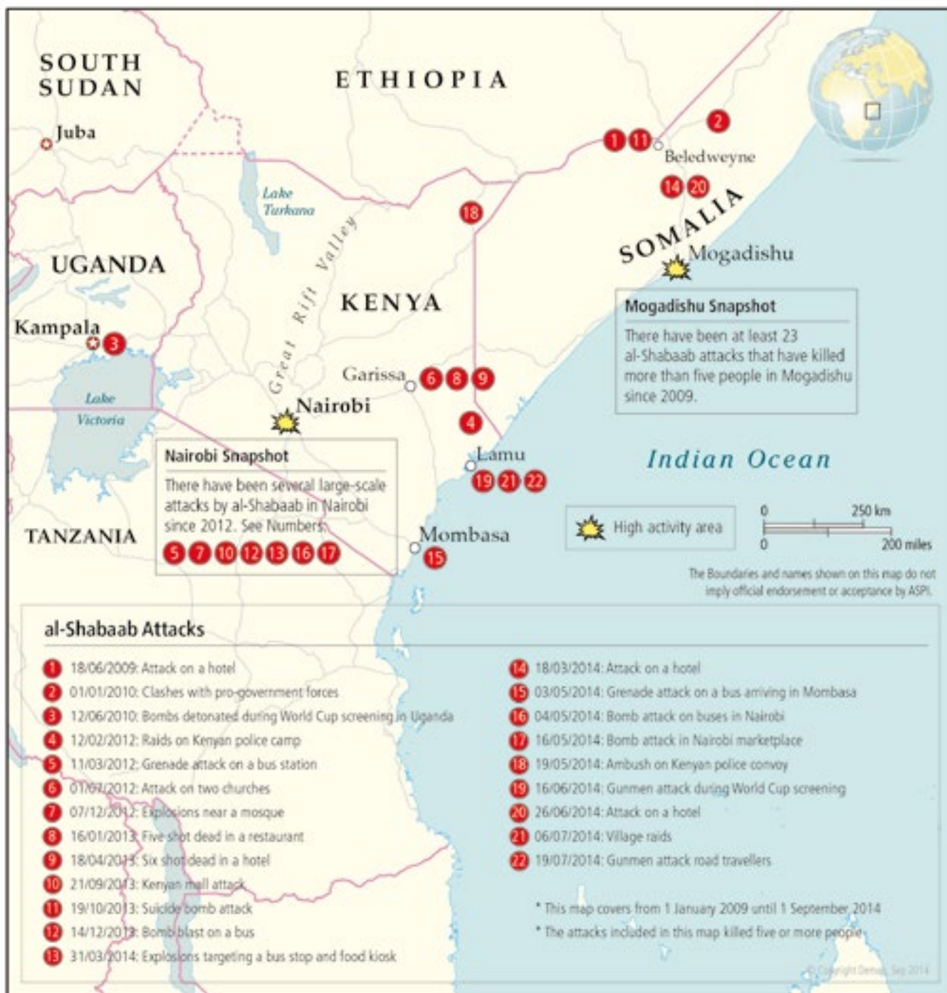
Figure 2: al-Shabaab attacks

failed state for over 20 years. In 2013, the EU, with the UK playing a leading role, agreed to provide financial assistance to Somalia for peace and development, with the aim of reversing years of failure by the international community. It was only in September 2013 that the EU announced a €1.8 billion package to assist the Somalian Government's