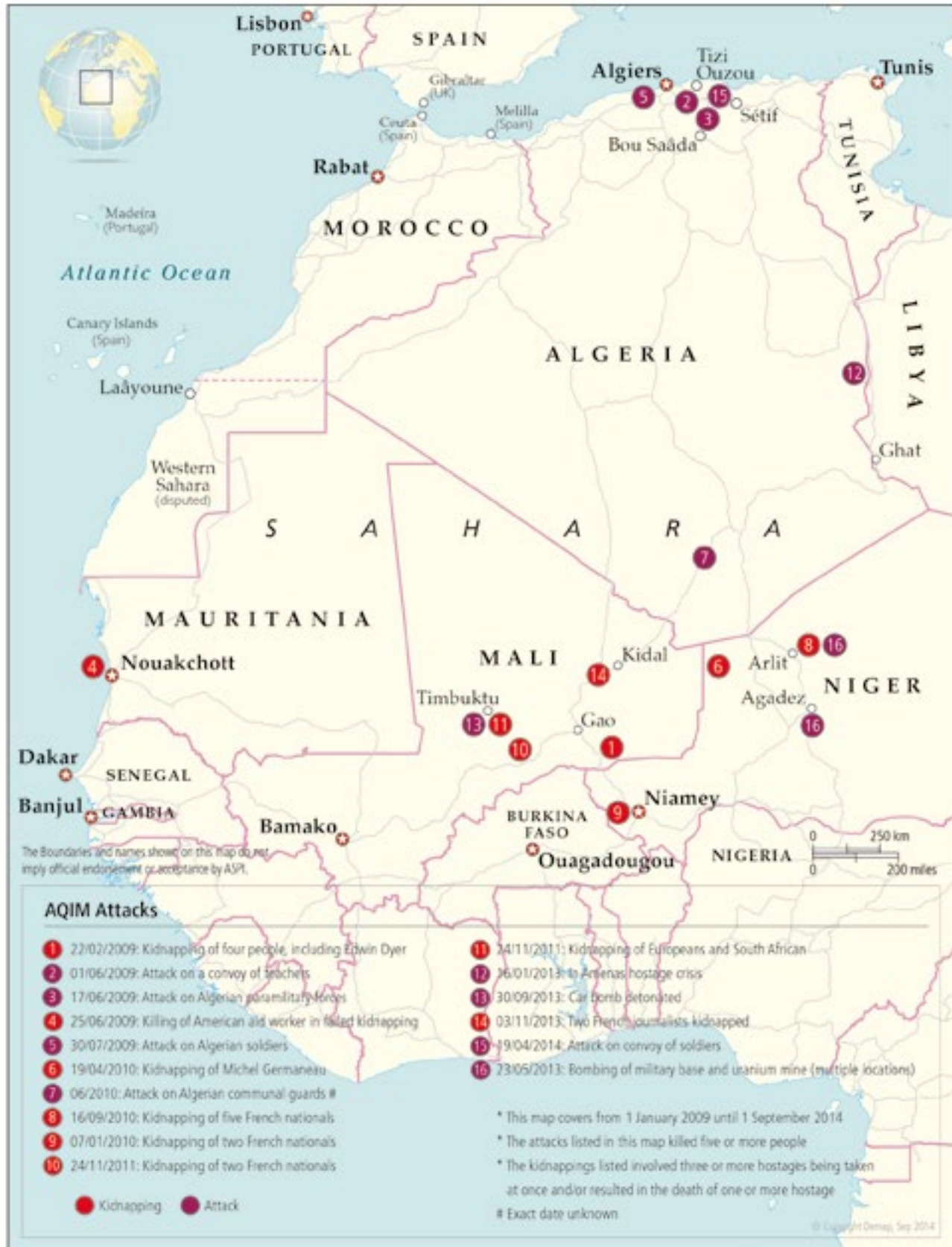
Figure 1: AQIM attacks