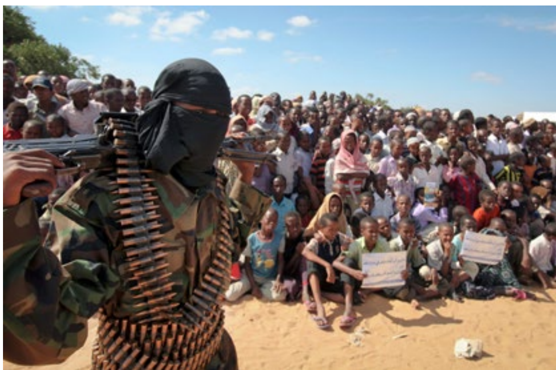
In this 13 February 2012 file photo, an armed member of the militant group al-Shabab attends a rally in support of the merger of the Somali militant group al-Shabab with al-Qaida, on the outskirts of Mogadishu, Somalia.

The propaganda effort has also increased since 2008, and the pool of militants involved in al-Shabaab has diversified. The group has established the Kata'ib Foundation as a media wing. It produces online films and propaganda material and runs an English-language Twitter account, which have drawn foreign recruits into its ranks. Al-Shabaab has enjoyed some success in reaching out to the Somali diaspora in the US, Europe, the Middle East and Australia. Michael Adebolajo, one of the killers of British soldier Lee Rigby, was arrested in Kenya by Kenya's counterterrorism police in 2010 for attempting to join al-Shabaab. He was deported back to the UK, but no charges were brought against him. However,