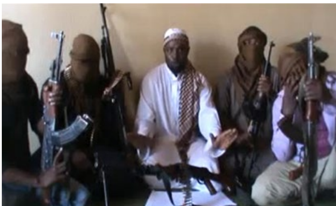
This screengrab taken from a video released on YouTube on 12 April 2012 apparently shows Boko Haram leader Abubakar Shekau (C) sitting flanked by militants.

Although few in number, the membership of the group illustrated the complexity of the current Nigerian political