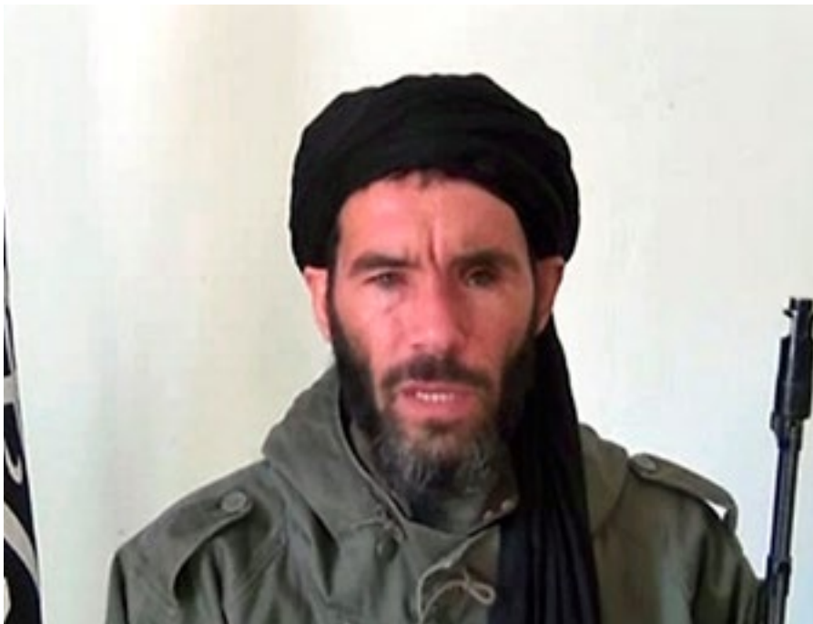
An undated grab from a video obtained by ANI Mauritanian news agency reportedly shows former Al-Qaeda in the Islamic Maghreb (AQIM) emir Mokhtar Belmokhtar speaking at an undisclosed location. The one-eyed Islamist leader masterminded an assault on an Algerian gas plant that left 37 foreign hostages dead in January 2013.