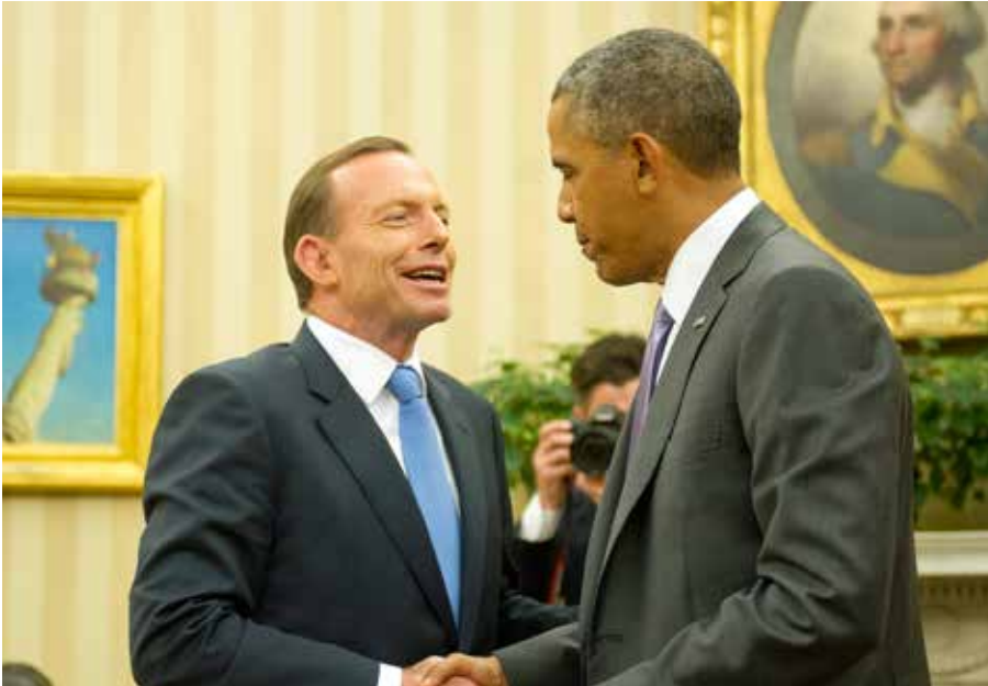
US President Barack Obama shakes hands with Prime Minister Tony Abbott of Australia in the Oval Office the White House in Washington DC - 12 June 2014.