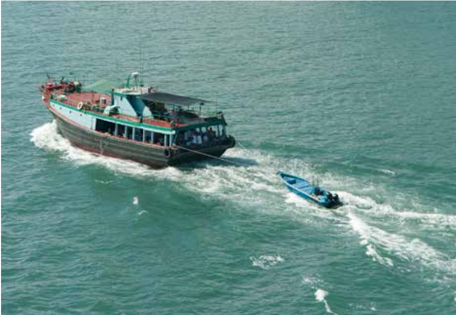
Chinese fishing vessel sailing in China's coastal waters.