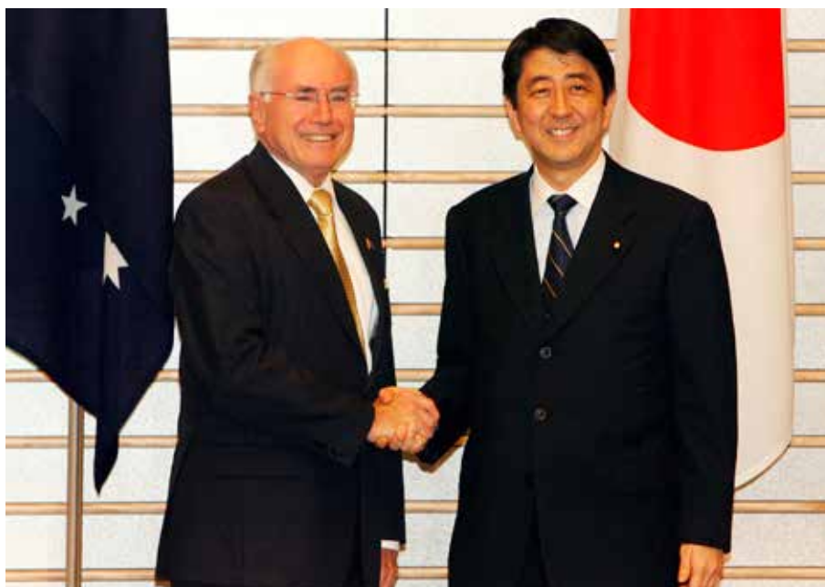
Visiting Australian Prime Minister John Howard is welcomed by Japanese Prime Minister Shinzo Abe prior to their talks at the Prime Minister's official residence in Tokyo - 13 March 2007.

On the back of collaboration in post invasion Iraq and the 2004 Boxing Day Tsunami and propelled by a shared sense of the need for America's allies to begin to do more with one another, Australia and Japan have begun to develop a close security relationship. This has involved both formal elements, with four agreements relating to security cooperation signed since 2007, as well as a wide range