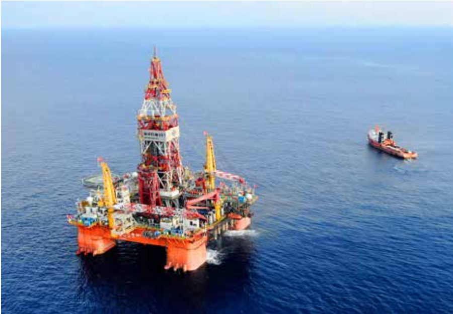
Haiyang Shiyu oil rig 981 in the South China Sea.