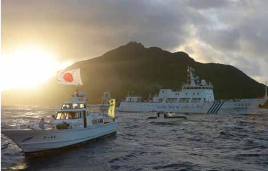
Chinese surveillance ship, rear centre, sails near Uotsuri island in Japanese, or Diaoyu Dao in Chinese, the biggest island in the disputed Senkaku Islands, or Diaoyu Islands. Japan - July 1 2013.