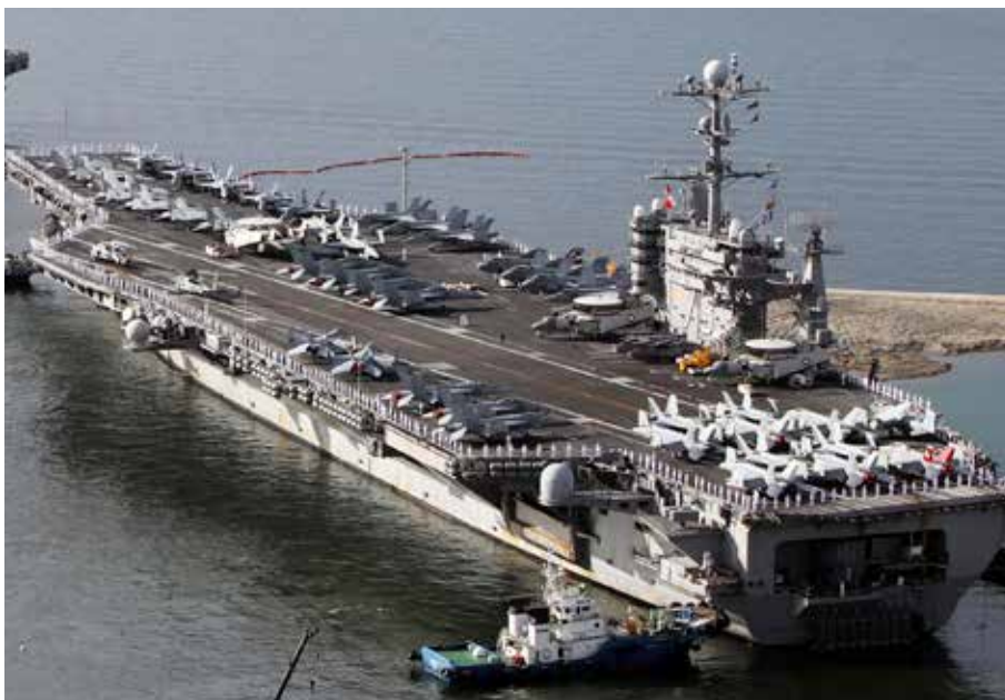
The USS George Washington, a 97,000-ton U.S. aircraft carrier that is taking part in naval drills with South Korea off the western coast of the Korean Peninsula - 28 November 2010.

if not impossible, in the absence of detailed information about just how conflict would unfold. The fact that China has arguably acted as the aggressor in the second scenario, for instance, may make the probability of Australian intervention even more likely than in the third scenario, where a case can be made that Japan was the more heavy-handed of the protagonists and thereby responsible for provoking the ensuing crisis. Often, of course, the precise circumstances around the eruption of conflict are murky with each side apportioning blame, as occurs in the first scenario. However, in those situations where there is a clear instigator of conflict that factor is likely to have considerable impact upon an Australian decision to become involved.