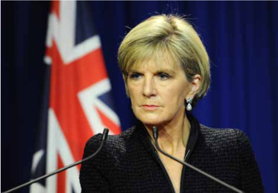
Foreign Affairs Minister Julie Bishop speaks during a media conference in Melbourne - 29 September 2014.