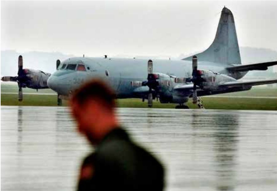
U.S. Navy EP-3 surveillance plane parks on an apron in the rain at Kadena Air Base in Okinawa, southern Japan.