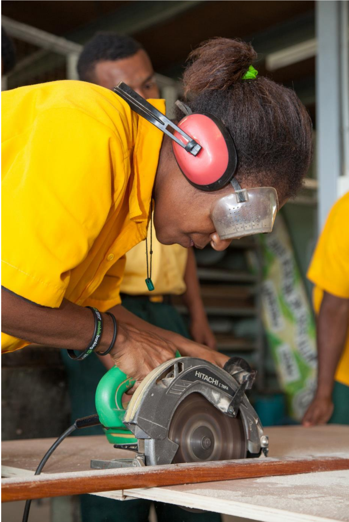
Students at the Hohola Youth Development Centre, Papua New Guinea, learning vocational training skills.