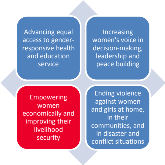
Figure 1 Actions in the 2011 Australian aid program gender policy

The 2011 policy improves on the 2007 policy by adding the prevention of violence against women to the high-level themes, reflecting the increased attention and understanding that this issue has received since 2007. In doing so, the 2011 policy is aligned with current international thinking on women’s equality. This emphasises the need for integrated models that concurrently address multiple facets of empowerment. As UN Women puts the case: