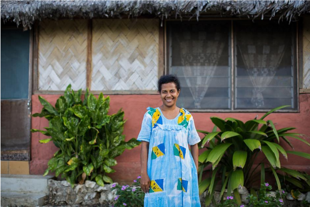
The owner of Lakatoro Palm Lodge on Malekula island, Vanuatu. This bungalow owner, like many others, has received training and support from the DFAT-funded technical and vocational education and training program.