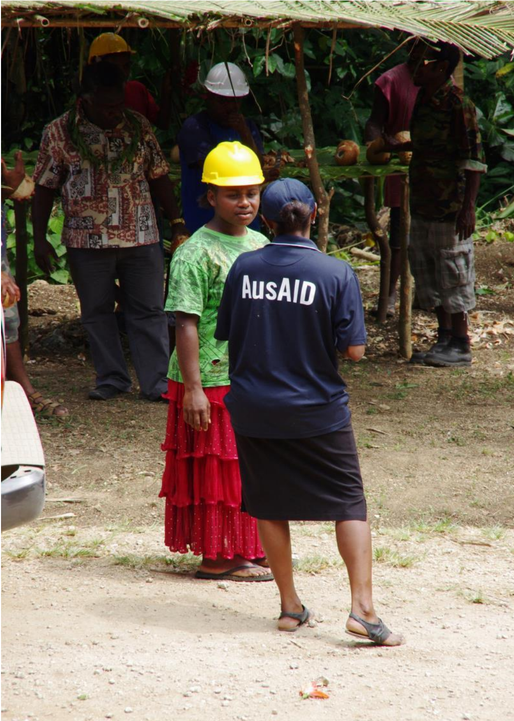
A female roads maintenance worker talks to an Australian Government representative in Malekula, Vanuatu, 2011. Australia’s support for rural road improvements uses local contractors, and is providing much-needed skills and jobs for women and men.