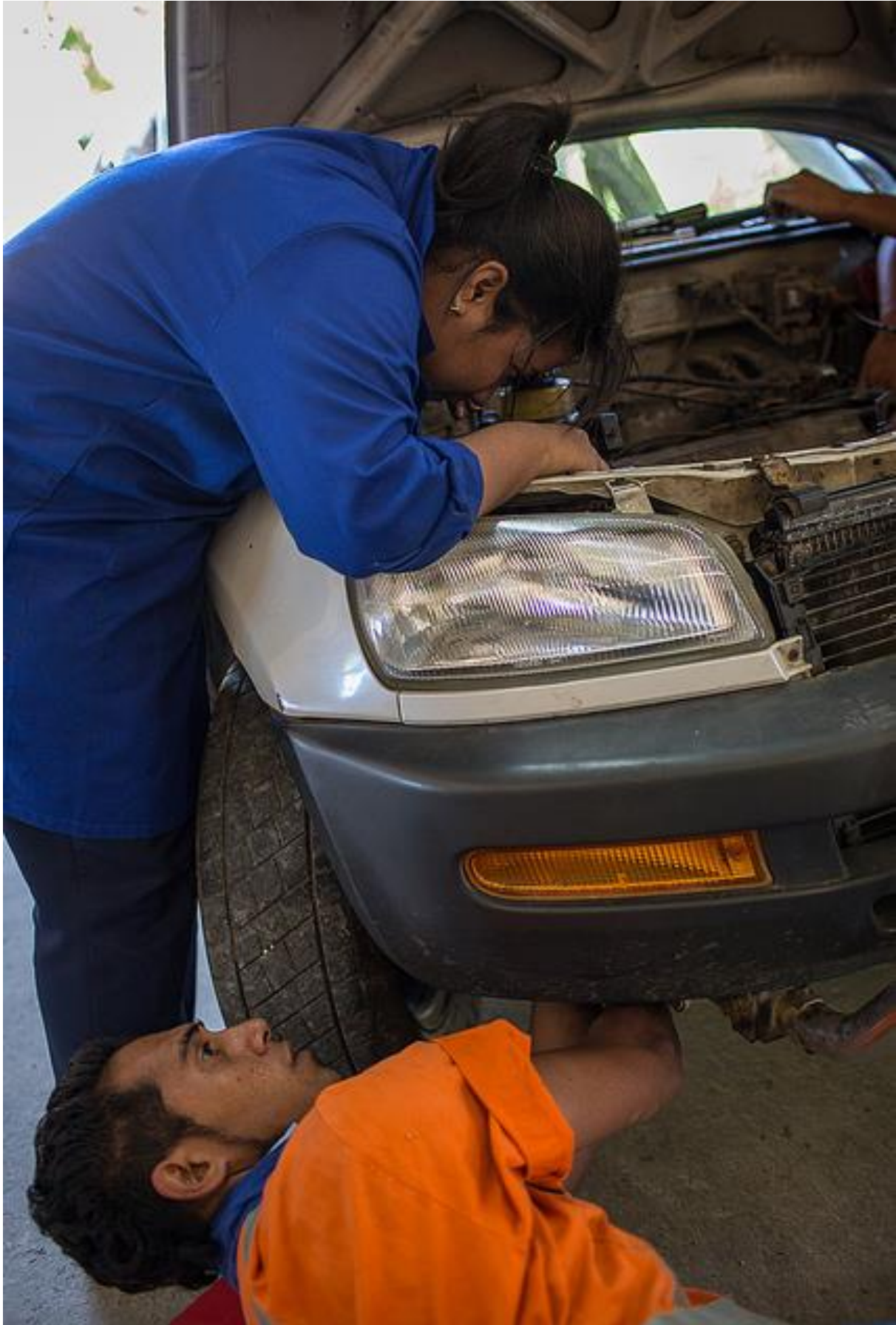
Light vehicle mechanics students repair a vehicle at the Tonga Institute of Science and Technology.