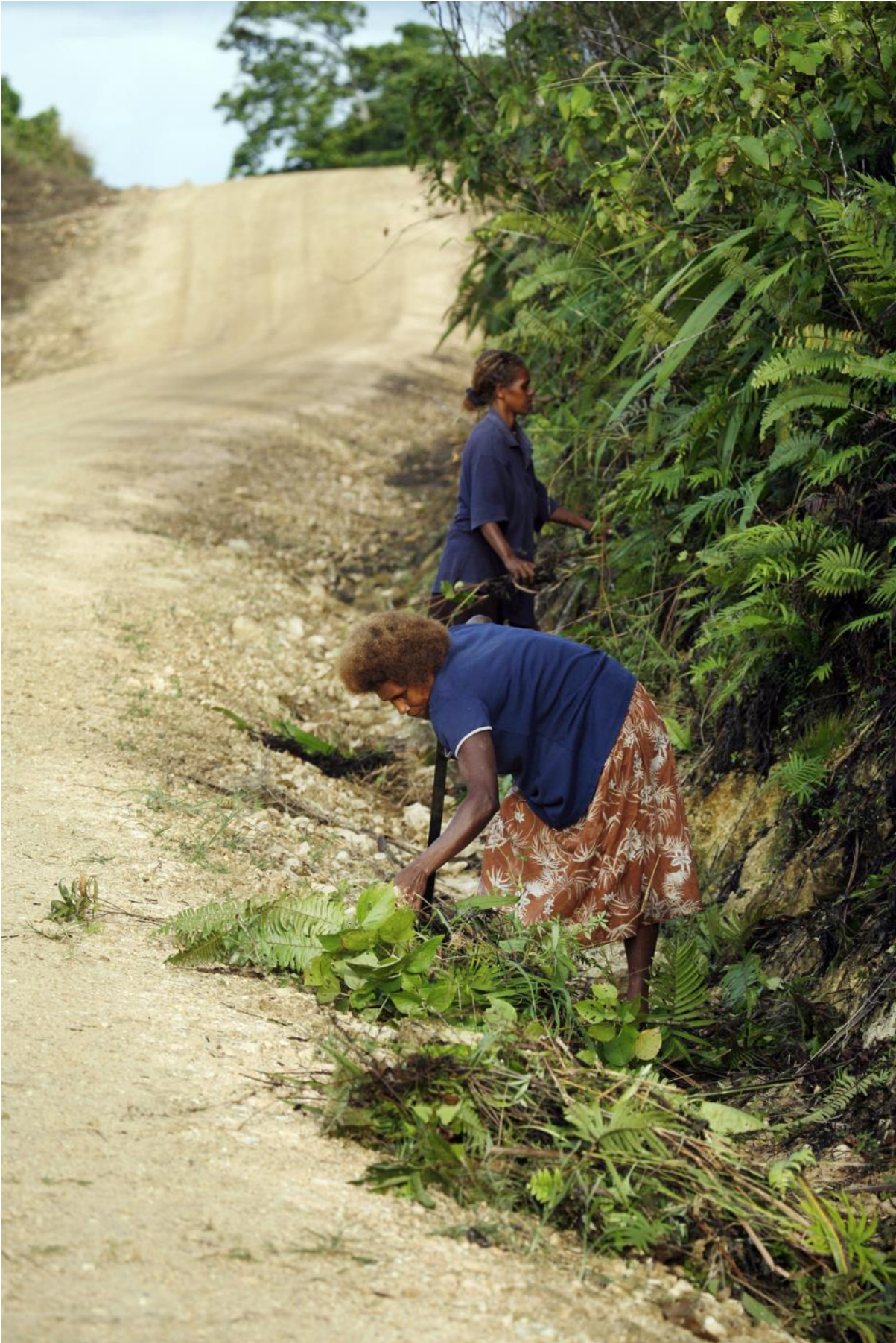
Women employed to maintain roads, Auki-Malu'u, Solomon Islands, 2007.