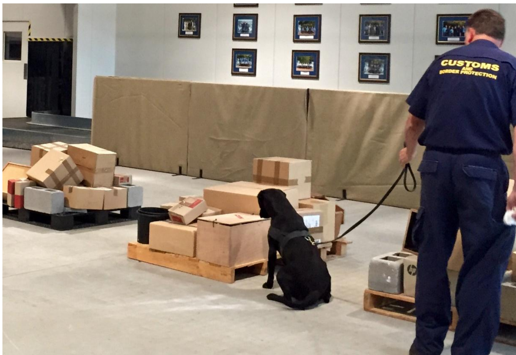
Figure 2.2: Detector dog alerting handler to the presence of explosives in the package as part of a training exercise

2.52 The committee would like to thank the customs officers at the National Detector Dog Program Facility for their time and the knowledge they imparted and commends them on the important role they play in protecting the community.