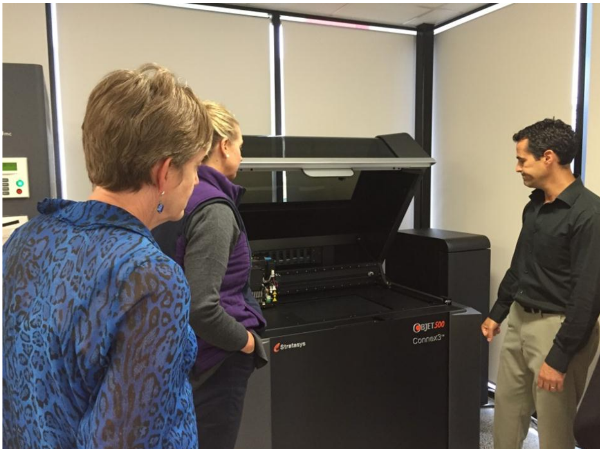
Figure 3.1: Committee members inspect a 3D printer