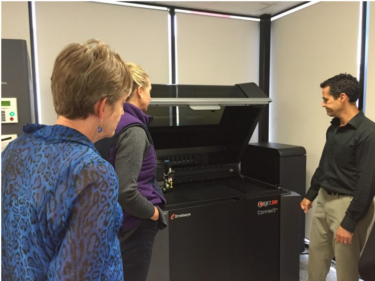
Figure 6.1: Committee members inspect a 3D printer