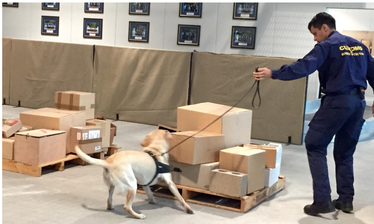
Figure 2.1: Customs' officer and dog searching pallet for explosives as part of a training exercise

1.83 The committee also observed younger dogs honing their natural instincts for searching through exercises conducted with their trainers: