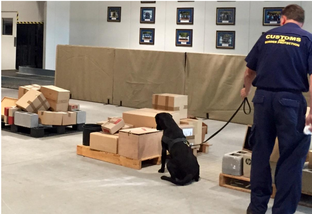
Figure 2.2: Detector dog alerting handler to the presence of explosives in the package as part of a training exercise

1.88 The committee would like to thank the customs officers at the National Detector Dog Program Facility for their time and the knowledge they imparted and commends them on the important role they play in protecting the community.