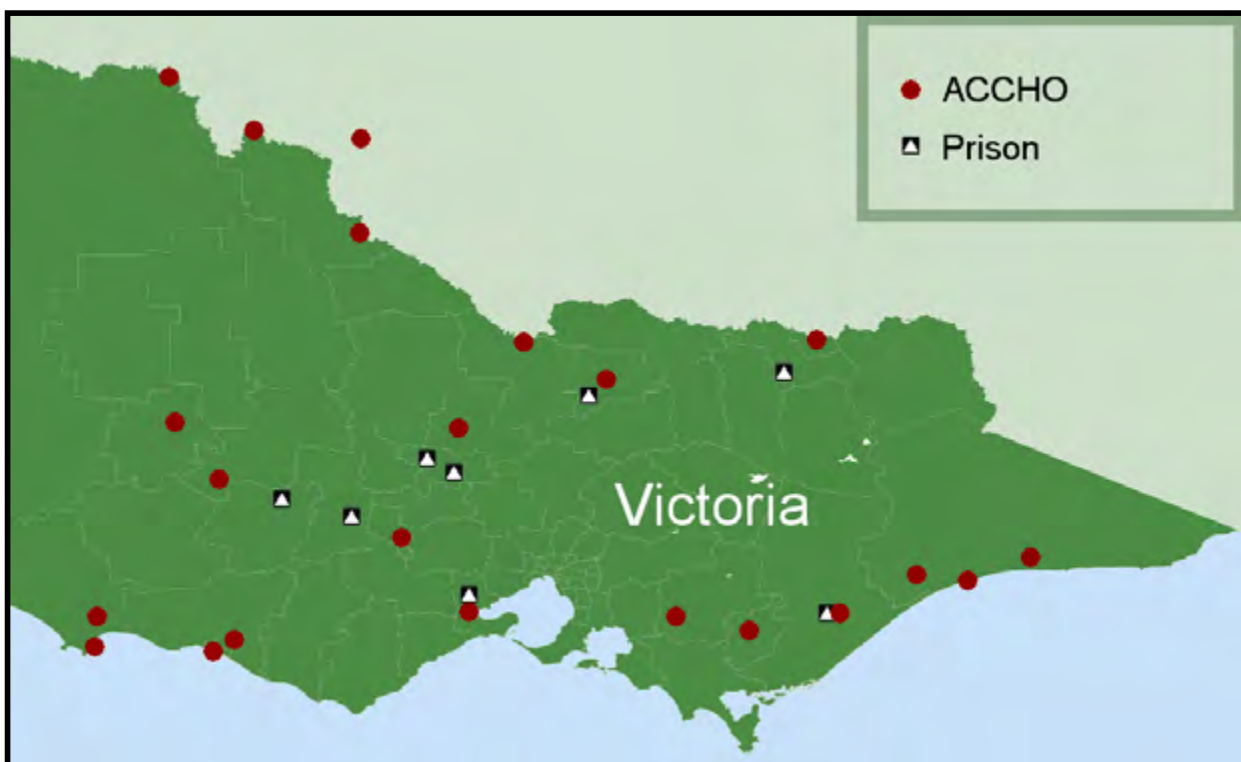
Figure 2: Victorian ACCHOs and prisons

ACCHOs are located within 55km of all Victorian prisons. Figure 2 and Figure 3 below illustrate the geographical distribution of ACCHOs and prisons across Victoria.