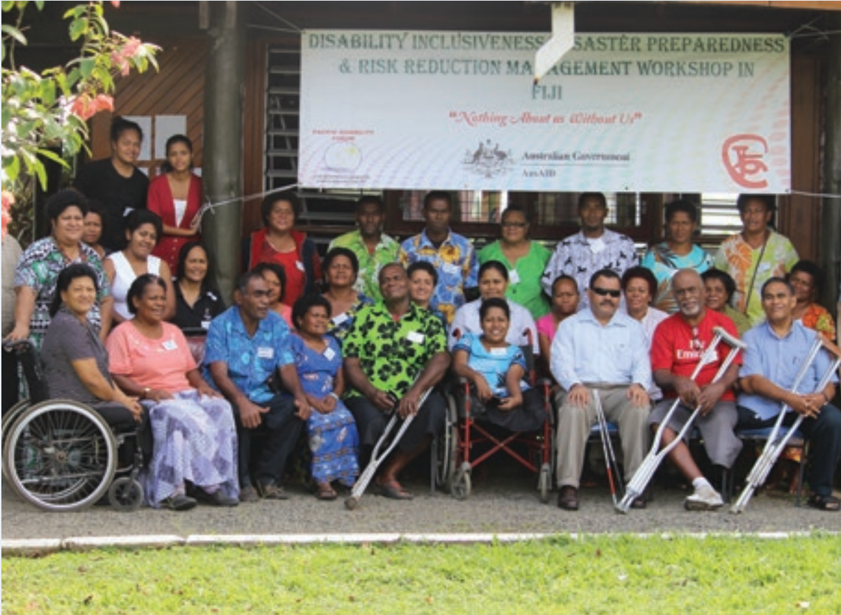
Disability-Inclusive Disaster Preparedness and Risk Reduction Management Workshop held in Nadave, Fiji, 2013.

In the Pacific, the impact of disasters on communities and social and economic development is significant, yet people with disabilities are often excluded from efforts to plan ahead, respond and recover. The Pacific Disability Forum and other disabled people’s organisations in Fiji, Kiribati, Samoa, Solomon Islands, Tonga and Vanuatu have been working together with National Disasters Offices to make disaster risk reduction and response measures more inclusive, drawing directly on the lived experience of people with disabilities. Recognising their innovative approach, the Pacific Disability Forum was awarded the inaugural Pacific Innovation and Leadership Award for Resilience by the UN Office for Disaster Risk Reduction.