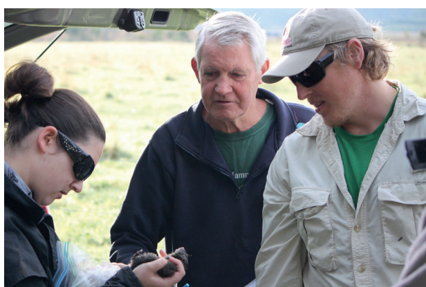
Figure 2: The Atlas of Life in the Coastal Wilderness is a regionally-based, community-led project that has contributed over 11,000 species sightings to the Atlas of Living Australia in less than four years. It is a rich contribution to a large, long-term and critical data resource for the nation. Atlas of Life in the Coastal Wilderness, 2014.

Like any scientific endeavour, the appropriateness of citizen involvement and best form for that involvement to take have to be carefully evaluated. 9,10 Projects that require complex observation or data collection techniques will often call for skills that only years of professional training and experience provide. However, many projects are well suited to participation by members of the community, who can follow the principles of scientific inquiry 11 to make valuable contributions.