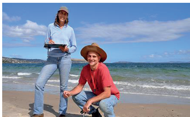
Figure 4: Earthwatch is an internationally successful model where citizen scientists join professional scientists to investigate environmental issues. In Australia, Earthwatch expeditions have contributed to over 300 peer-reviewed scientific papers. Earthwatch, 2013.

For society: new information for government decision-making, greater interest in science and understanding of scientific principles, greater