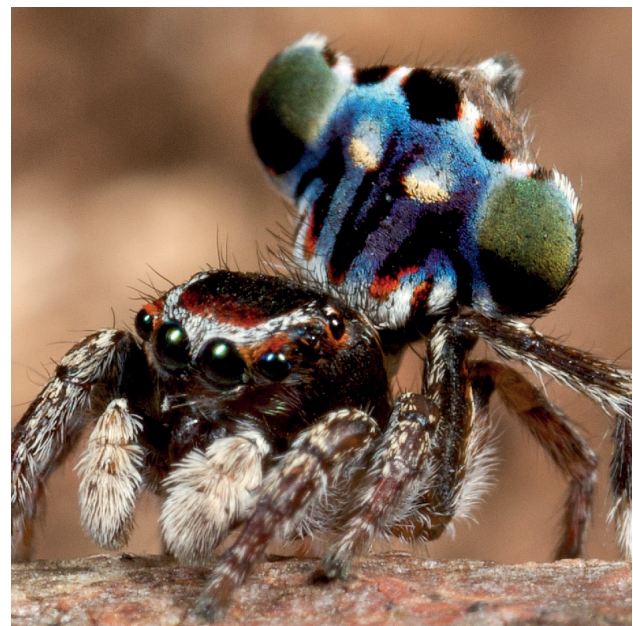
Figure 1: Peacock spider, Maratus harrisi, discovered by citizen scientist Stuart Harris.

Australian citizen scientists have discovered new species (Figure 1), played a role in breakthroughs on debilitating diseases 4 , identified and classified distant galaxies 5 , and contributed to new ecological theories. 6