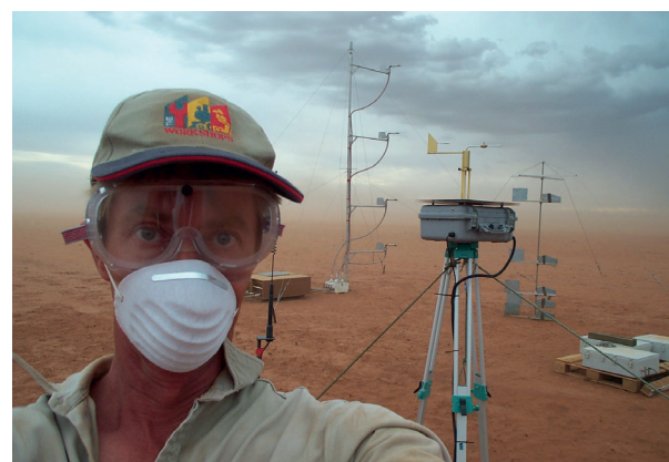
Figure 7: Citizen scientists in the DustWatch program monitor dust activity using instruments such as deposition traps and high volume air samplers.