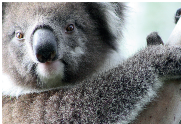
Figure 3: Over 500 people searched for koalas on one day in South Australia, recording 1500 sightings as part of The Great Koala Count. Researchers developed a model of koala distributions from the spatial data collected. 12 The project was run as a collaboration between the University of South Australia, ABC Local Radio, the South Australian Government, CSIRO and the local community. Philip Roetman, 2011.

More complex projects require scientists to provide more training or support for citizen scientists. They typically involve fewer participants 6 or operate on a smaller scale (Figure 4) to ensure that high-quality evidence is obtained.