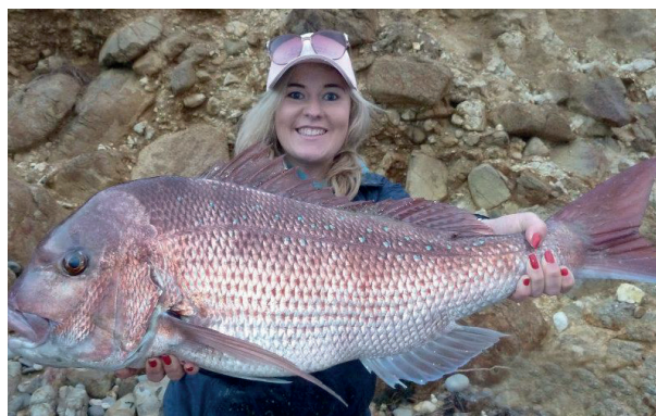
Figure 6: Participants in Range Extension Database and Mapping project (or 'Redmap') record and share observations of marine species that are unusual to a given area via a website or smartphone app. The data helps scientists to map changes in the distribution of marine species against changes in the marine environment. All photographic observations are verified by a member of Redmap's network of 80 scientists. Jonah Yick, 2015.

Moreover, advances in instrumentation such as devices that monitor and record temperature and acidity make it possible for non-experts to take reliable and precise measurements of an increasing number of parameters (Figure 7).