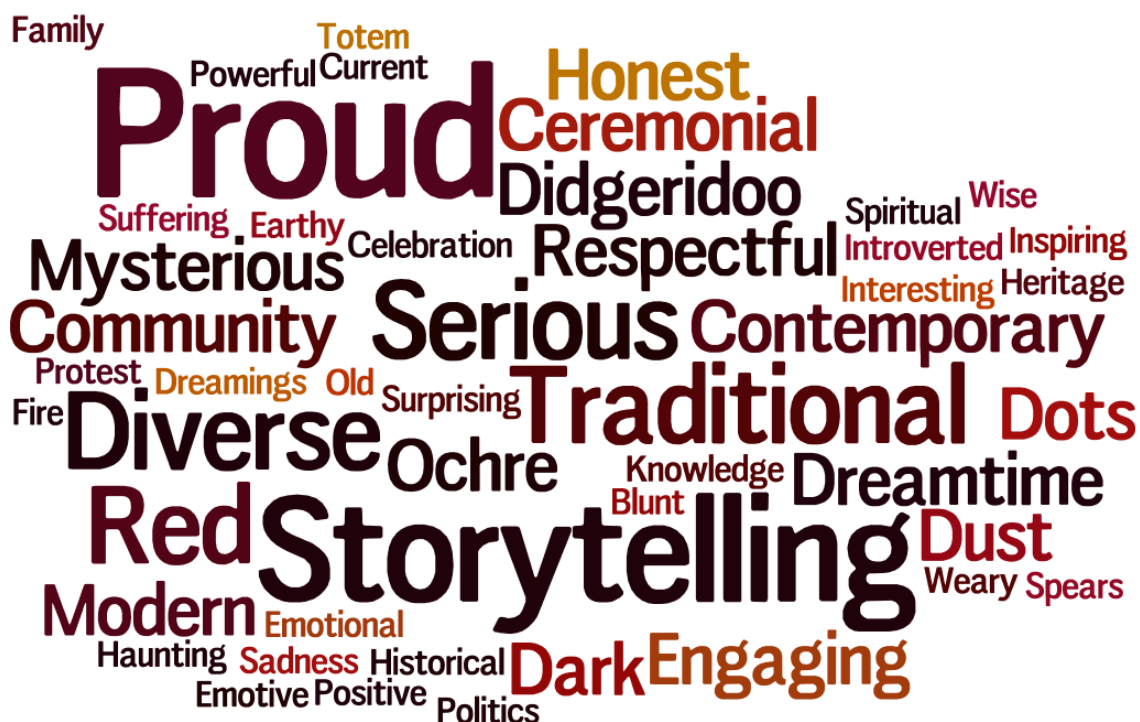
Figure 3. Engaged audiences' image of Aboriginal and Torres Strait Islander art

For many engaged audiences, Aboriginal and Torres Strait Islander art is seen as embedded in traditional cultural practices, with strong associations with ceremonial practices, the didgeridoo, ochre, fire, dots, dust, protest, celebration and the Dreamtime. These associations engender a high degree of respect from engaged audiences and also create an image of Aboriginal and Torres Strait Islander art that is quite serious. Engaged audiences also recognise and value the diversity within Aboriginal and Torres Strait Islander arts. Some engaged audiences also have strong connections to the contemporary nature of some Aboriginal and Torres Strait Islander art. Such a strong image is formed from a range of past positive experiences, which creates an expectation and desire for more experiences in the future.