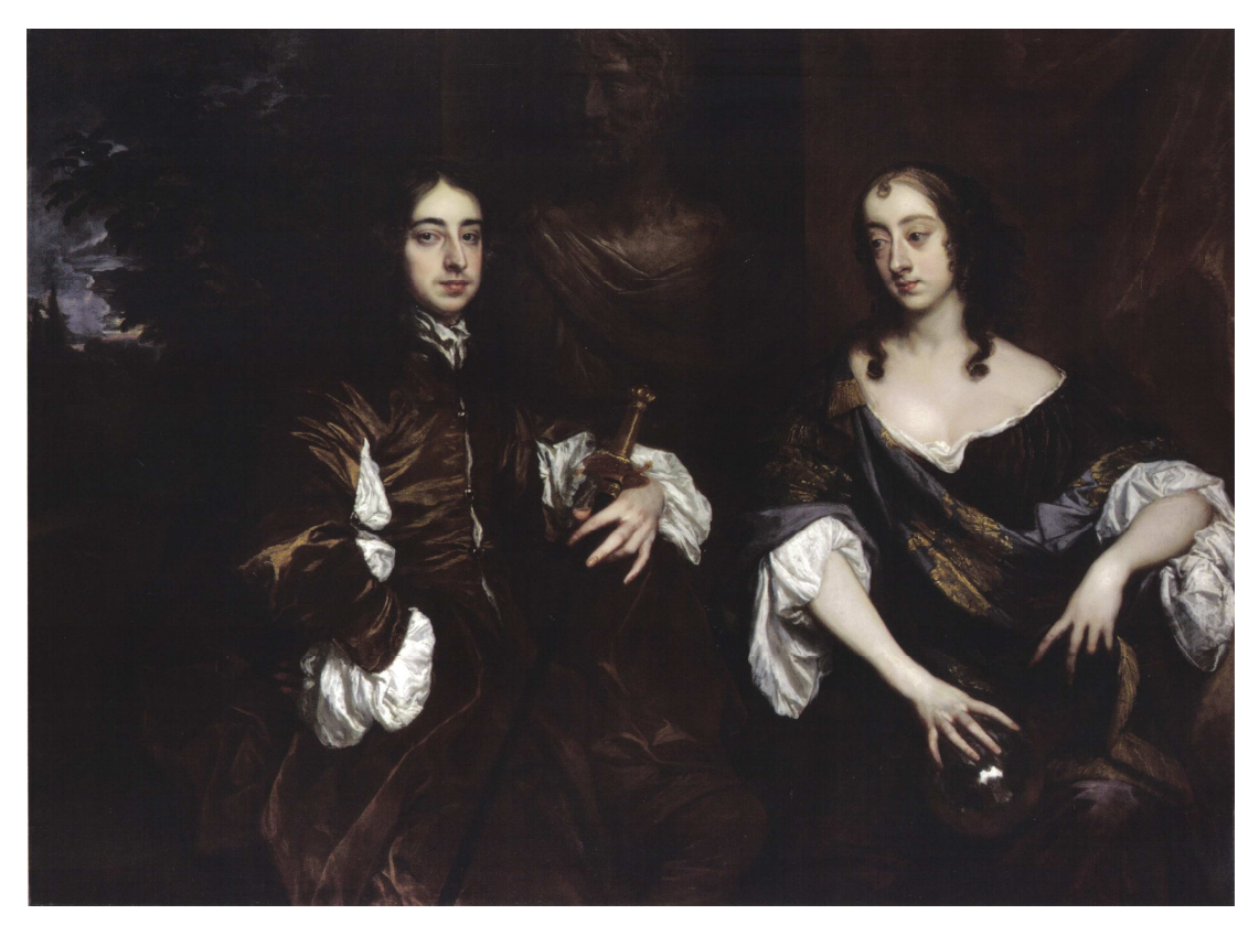
19. Arthur Capel, 1<sup>st</sup> Earl of Essex and Elizabeth, Countess of Essex (1653) by Sir Peter Lely (National Portrait Gallery, London).