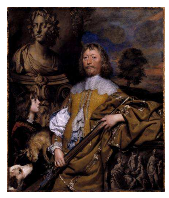
29. Endymion Porter (1642-5) by William Dobson (© Tate, London 2007).