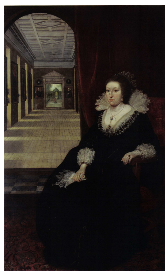
21. Alathea, Countess of Arundel and Surrey (1618) by Daniel Mytens (National Portrait Gallery, London).