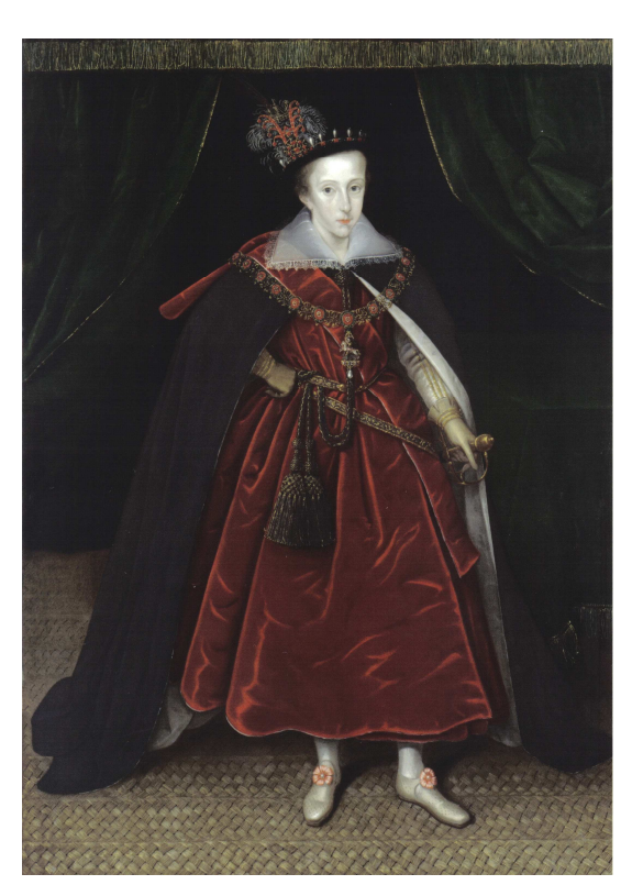
7. Henry Prince of Wales (1603) by Marcus Gheeraerts the Younger (National Portrait Gallery London).