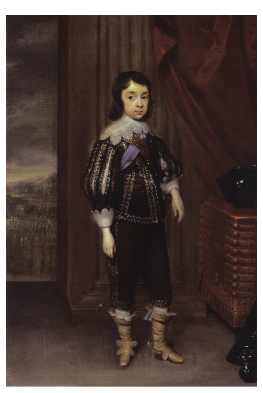
6. Charles II (1639) by Cornelius Johnson (National Portrait Galley, London).