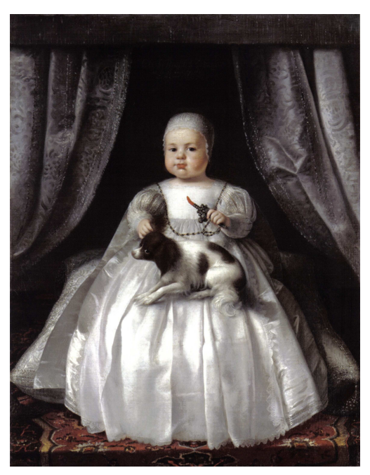
2. Charles II (1630) by an unknown artist (National Portrait Gallery, London).