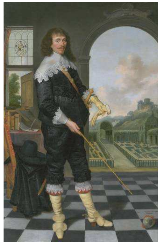
28. William Style of Langley (1636) by the British School 1600-99.