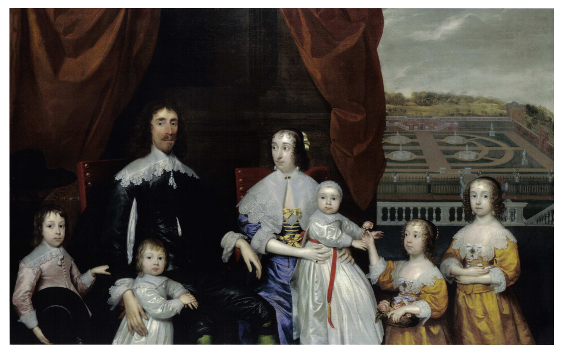
13. The Capel Family (1640) by Cornelius Johnson (National Portrait Gallery, London).