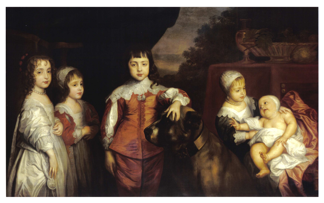
11. Five Children of Charles I (1637) after Anthony Van Dyck (National Portrait Gallery, London).