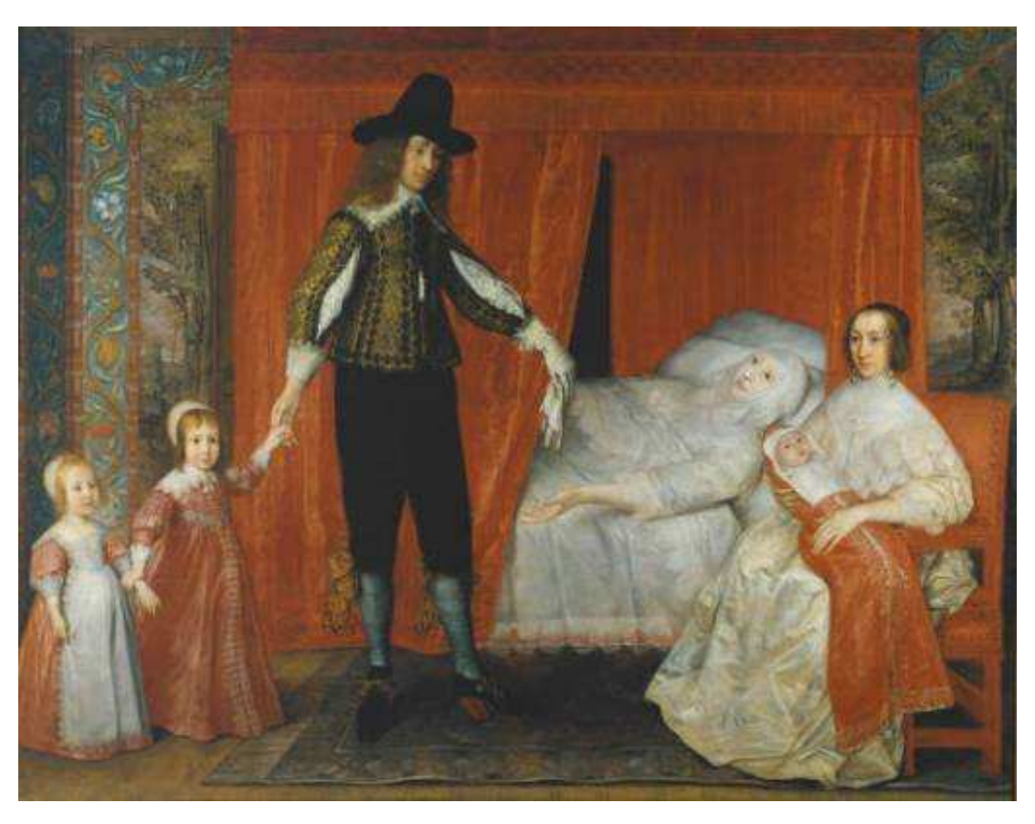
16. The Saltonstall Family (c.1636-7) by David Des Granges.