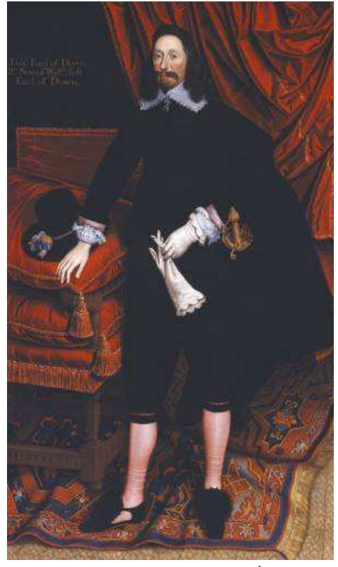
27. Sir Thomas Pope, later 3<sup>rd</sup> Earl of Downe (c.1635) by the British School 1600-99.