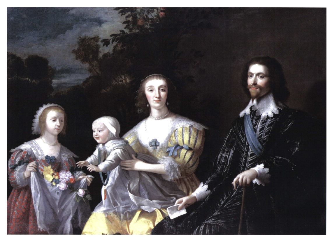
12. The Duke of Buckingham and his Family (1628?) after Gerrit van Honthorst (National Portrait Gallery, London).