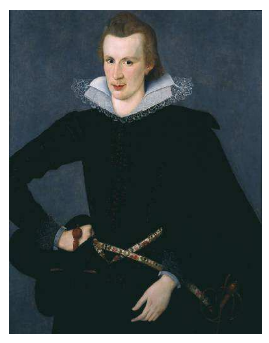
25. Unknown man in a slashed black doublet (c.1605) attributed to Sir William Segar.