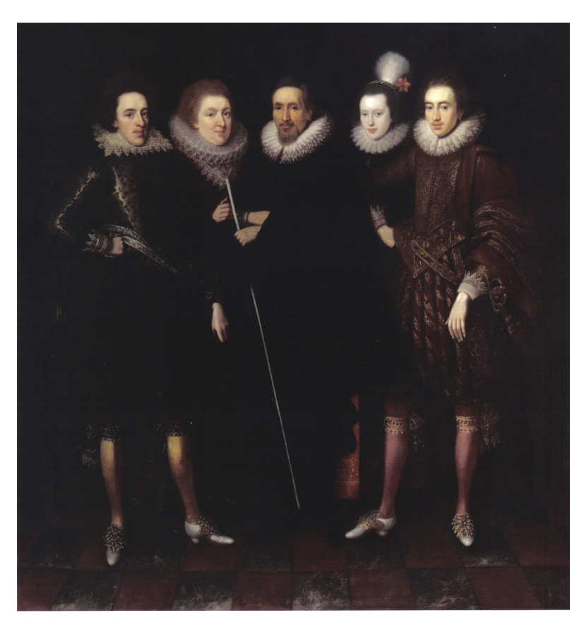
14. The 1<sup>st</sup> Earl of Monmouth and his Family (1617) attributed to Paul Van Somer (National Portraits Gallery, London).