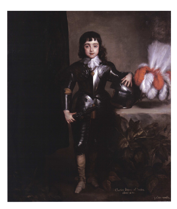
5. Charles II (1638) by Anthony Van Dyck and Studio (National Portrait Gallery, London).