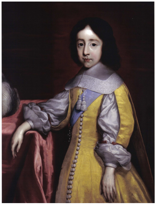
4. William III (1657) after Cornelius Johnson (National Portrait Gallery, London).