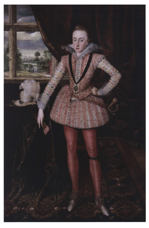
8. Henry Prince of Wales (1610) by Robert Peake the Elder (National Portrait Gallery, London).