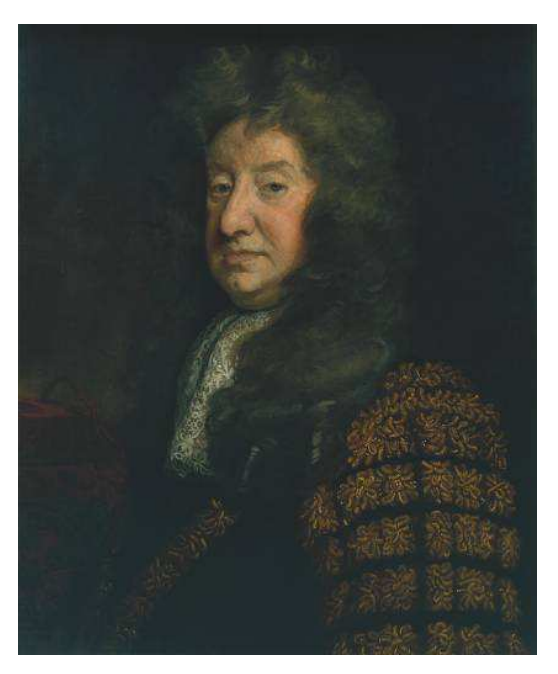
44. First Marquiss of Tweedale (1695) by Sir Godfrey Kneller.