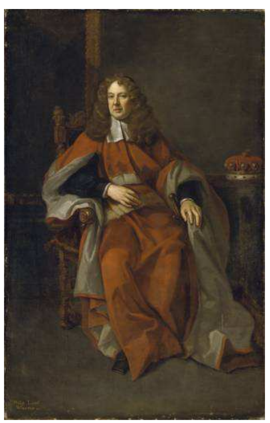
33. Philip 4<sup>th</sup> Lord of Wharton (1685) by Sir Godfrey Kneller.