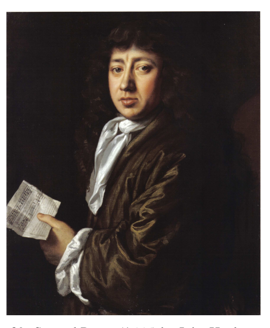
39. Samuel Pepys (1666) by John Hayls (National Portrait Gallery, London).