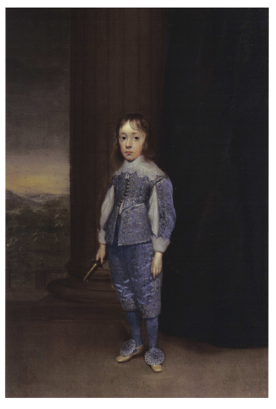
9. James II (1639) by Cornelius Johnson (National Portrait Gallery, London).