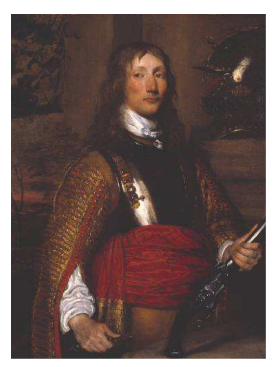
30. Portrait of an Unknown Officer (1645) by William Dobson.