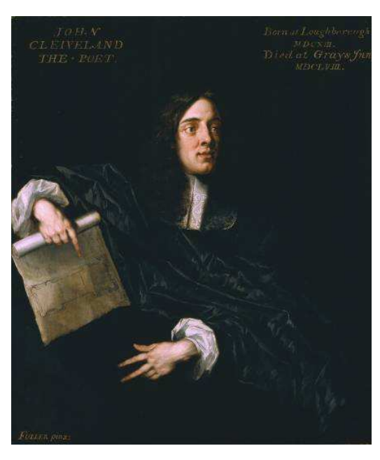
36. John Cleveland? (c.1660) by Isaac Fuller (© Tate, London 2007).