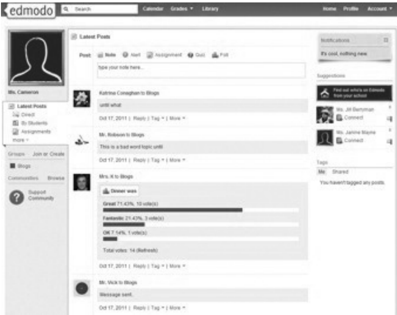
Figure 11.2 An example of an Edmodo site page.

customization and tower building. The sequence was used to structure the students' learning pathways and provide learning support through gradual and sequential release of information and instructions. Internal alignment of outcomes, activities, and assessment was achieved by providing clear expectations, learning intentions, and task requirements through these activities and facilitating assessment submission. Learning support was also delivered throughout the activities, which included concept definitions and process instructions (Cram et al., 2010).