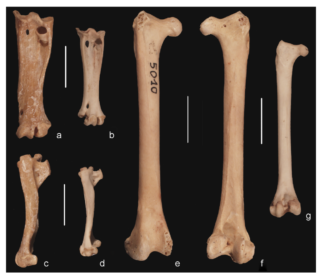
Fig. 3. Aegolius martae n. sp. a, c: right tarsometatarsus, holotype PU 100045, Marasà Cave: a: dorsal view and c: medial view. e, f: right femur, paratype MPUR 5010, Spinagallo Cave: e: cranial view and f: caudal view. Aegolius funereus. b, d: right tarsometatarsus, MCC 1146: b: dorsal view and d: medial view. g: left femur, MCC 1146, caudal view. The scale bars represent 1 cm.

Palaearctic Strigiformes, two other genera show a similarly shaped tarsometatarsus, Glaucidium and Surnia. The former is very small, while the latter is similar in size to the fossil. Nevertheless, after direct comparison, they can be excluded because the fossil's tarsometatarsus is not as stout as in these two genera, Surnia in particular. Moreover in Aegolius martae n. sp. the sulcus extensorius is well developed, while it is virtually absent in the extant Surnia ulula. The sulcus extensorius of the fossil bone is also medially and laterally delimited by two well-developed cristae, in particular the medial one, both absent in the other two genera. The fossil femur (paratype) shows similar proportions of Surnia ulula, but best fits Aegolius because the crista trochanteris is not tilted medially as in the other genera of Strigidae, in addition, it shows a deep and narrow fossa poplitea typical of this genus.