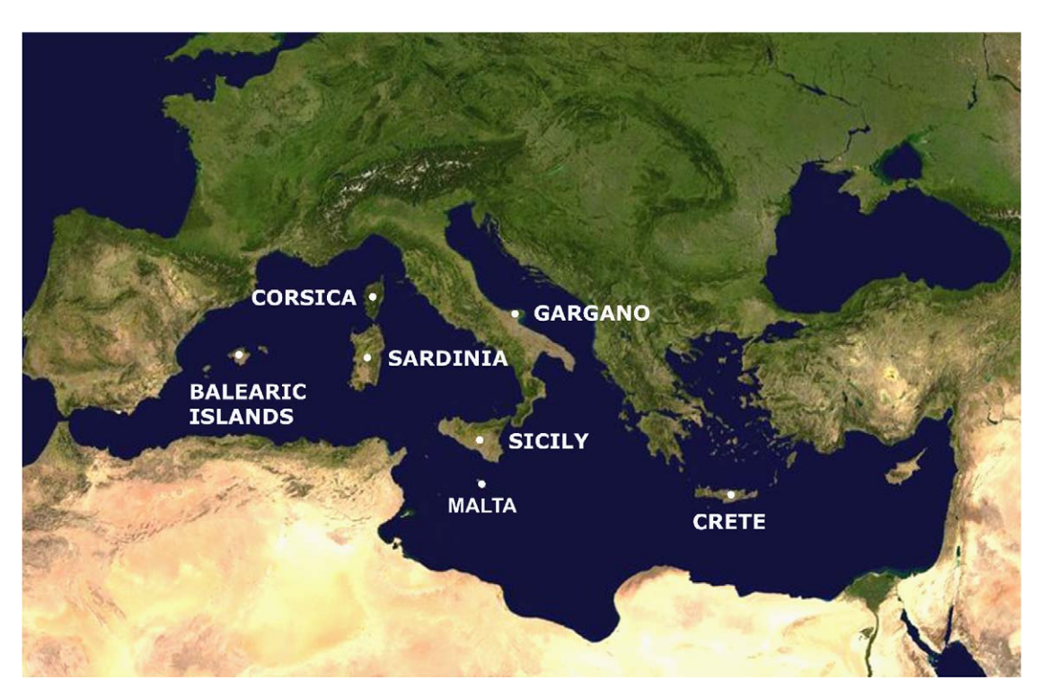
Fig. 1. Mediterranean Islands with endemic Strigiformes remains considered in this paper.

undescribed (M. Pavia, unpublished data). The Strigiformes are well represented with at least 6 taxa. In fact Ballmann (1973, 1976) reported three species of Tyto: T. gigantea, T. robusta and T. sanctialbani; the last one refers to T. balearica (Mlíkovský, 1998). In the same papers he reported three Strigidae, one of which is the new Strix perpasta. The Gargano material is under revision and its ongoing study reveals that probably all the Tyto species are endemic as are two of the three Strigidae as well (M. Pavia, orig.). In the Gargano taxa some of the size modifications normally associated with island Strigiformes can be observed: a great size increase in Tyto gigantea and Strix perpasta, while in Tyto robusta a lengthening of the hindlimbs is evident. The other species seem to be less modified, although their ancestors are unknown, and hence the trends that affected them are very difficult to determine.