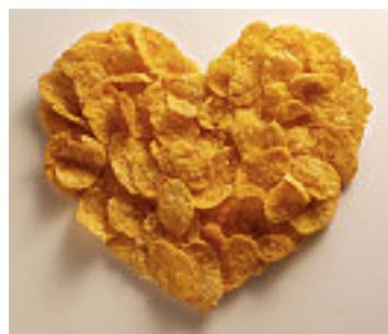
Fig. 1: Stock photo of a heart shape made with cereal.

In general, image perception can be subdivided into three levels: (1) primitive features (e.g. color, shape, texture), (2) objects (e.g. person, location, event) and (3) inductive interpretation (e.g. symbolic value, emotional cue, abstraction) [17]. In the case of Figure 1, a Level 1 feature may be the color brown . The shape heart is an example of a Level