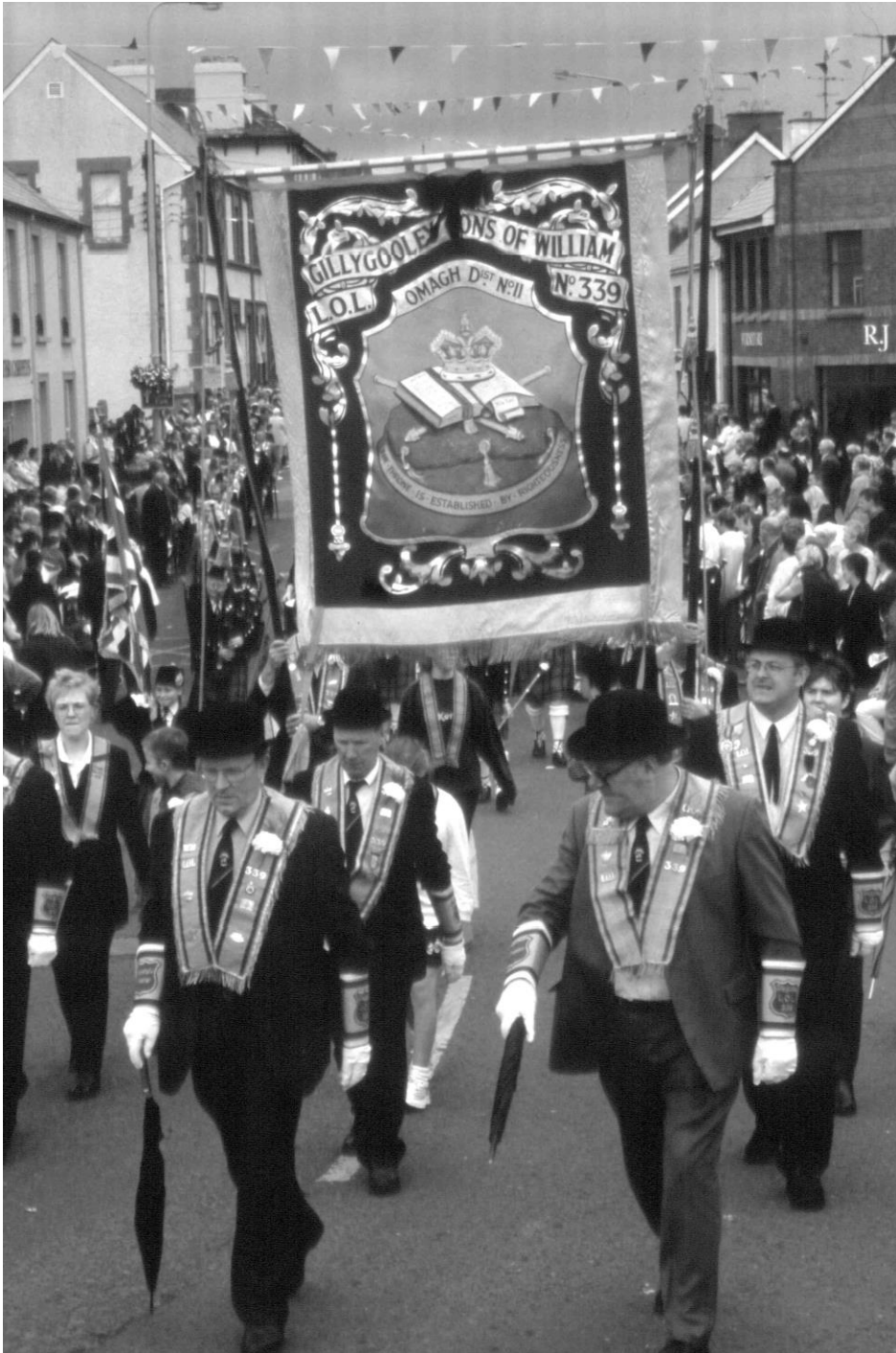
Image 1. Orangemen at the Twelfth, Castleberg, County Tyrone.

Any given Twelfth parade is made up of several local lodges of the Orange Order who march a circuit through a given town or city. One lodge after another marches, and each lodge musters its members in the same order. In front march the lodge officers, and behind them come the standard bearers carrying the lodge's painted silk banner. These banners tend to depict scenes from Ulster Protestant political history (such as William of Orange at the Boyne), scenes from wider Protestant religious history (such as Martin Luther posting his ninety-five theses in