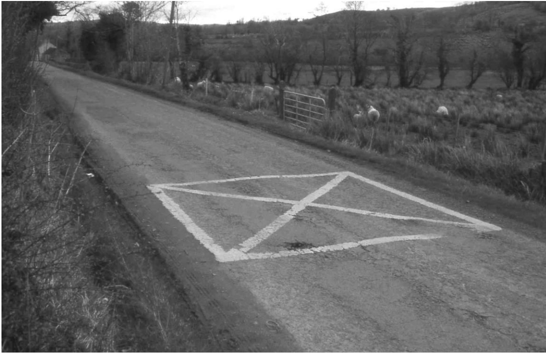
Image 3. X marks the border for checkpoints and air surveillance.