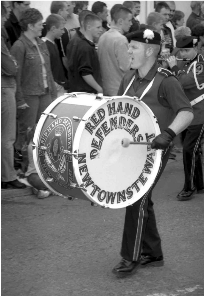
Image 2. “No Surrender,” a drummer for a paramilitary-linked band, Castleberg.

In terms of form, function, and meaning, the Twelfth Parade is a genre Bakhtin would characterize as markedly monologic. For Bakhtin, monologism is a reduction of manifold voices, orientations, and perspectives to a single vision of reality, and monologic genres include those that instill ideologies of binary opposition—Marxist or Hegelian dialectics, for example. More to the point, the binary sectarianism—maintained by the Twelfth and other genres that both establish and depend on a division between Catholic and Protestant—is inherently a monologic ideology.