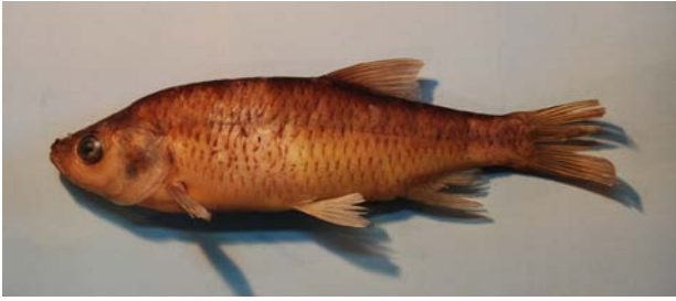
Fig. 2. Specimen of roach ( Scardinius knezevici ) caught in 2003 (Vlasina Lake reservoir).