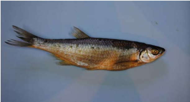
Fig. 3. Specimen of bleak ( Alburnus scoranza ) caught in 2003 (Vlasina Lake reservoir).

which originate from the Adriatic basin, has been clearly confirmed by the analysis of morphometric parameters, according to Kottelat and Freyhof (2007), in the form of naturalized populations Alburnus scoranza and Scardinius knezevici . On the other hand, the findings of the species Alburnus albidus , Rutilus basak (Adriatic basin) and Scardinius graecus and Pachychilon macedonicus (Aegean basin), described by Simonović and Nikolić (1997) and Simonović (2001), have not been confirmed in this research.