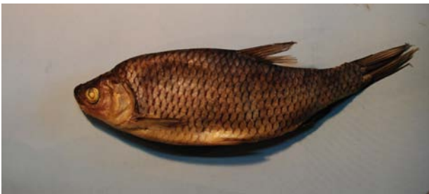
Fig. 2a. Specimen of roach ( Scardinius knezevici ) caught in 2011 (Vlasina Lake reservoir).