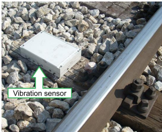
Fig.3. Wireless sensor for sleeper vibration measurements [17]