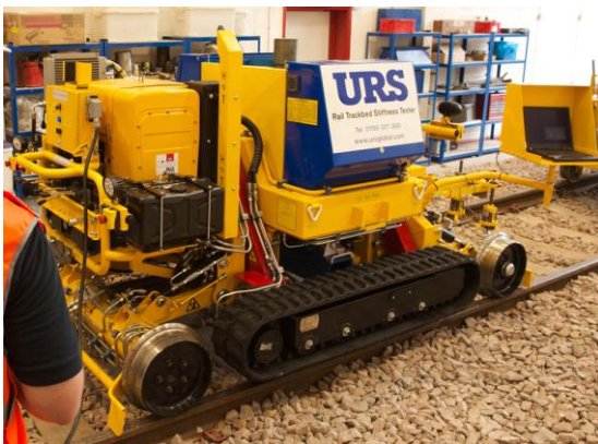
Fig.5. Rail-mounted device for track stiffness measurements used in UK [21]

There are several types of devices that are used for continuous track stiffness measurements, such as rail-mounted devices (as in Figure 5) or devices that could be installed in the inspection vehicle [20]. These devices usually measure vertical force and acceleration, while deflection is calculated by double integration of the measured acceleration (as in [17]).