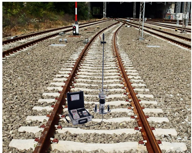
Fig.2. Sleeper deflection measurement using modified falling weight deflectometer

Kim et al. measured sleeper deflection on three sections of high-speed rail line in South Korea [16]. There were used three measurement methods in this research: a simple vertical deflection sensor, a modified falling weight deflectometer (as in Figure 2), and an optical system for deflection measurement. Analysis of the obtained results confirmed that poorly supported sleepers had larger deflections [16].