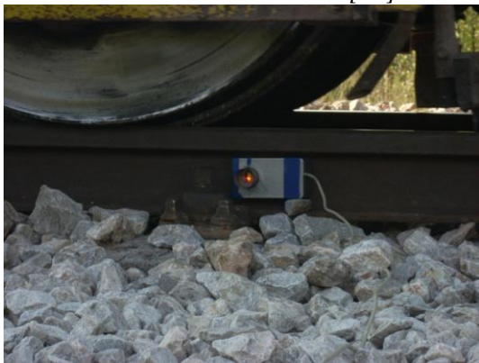
Fig.4. Position sensitive detector for sleeper vibration measurements

According to the definition of track stiffness [19], increase in the sleeper deflection would lead to the decrease in track stiffness. Therefore, track stiffness diagrams could be used for determination of track sections with poor sleeper support.