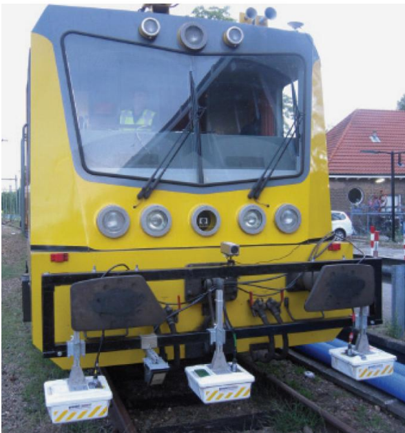
Fig.1. Inspection vehicle equipped with GPR on railway network in Netherlands

Direct methods for determination of sleeper support conditions imply ballast bed scanning using acoustic waves [3], ultrasound [13], or ground penetrating radar (GPR) [14,15]. These methods could be applied both continuously and manually. For example, there are inspection vehicles equipped with GPR that are used on railway networks in Switzerland and Netherlands (Figure 1).