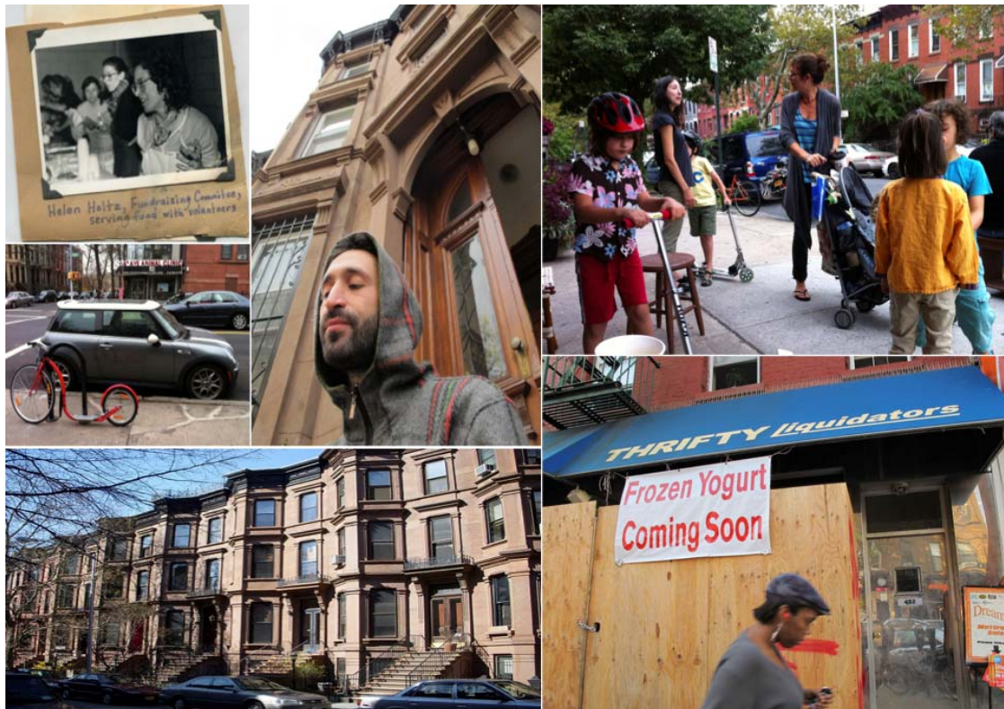
Figure 4. The urbanity of Park Slope's neighborhood

As Zukin remarks, the neighborhood of Park Slope created a model of aesthetically interesting, inner-city living, "(...) that by the 1980s would attract and retain a post-postwar middle class of professionals, artists, and intellectuals – a 'creative class' before the name was invented. 18 These significant changes nonetheless left a gap between celebrating the authenticity of historic houses and acknowledging the authenticity of the lower-class families who lived in them" (2010: 12).