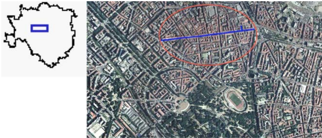
Figure 1. Neighborhood's geographic location in Milan inner city (blue rectangle), and a map of Paolo Sarpi's street (blue line) within the neighborhood (red circle)

Source: Author's elaboration on Municipality of Milan's cartography.