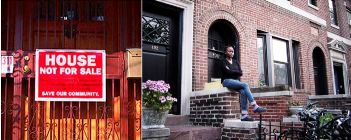
Figure 6. Action posted by the South Slope Community Group (on the left); Young woman sitting on the main entrance of her brownstones on the South Slope boundary 25 (on the right).

reads “House Not For Sale”. This neighborhood association urged everyone in the South Slope to display this sign prominently on their homes to show that they are united against non-contextual overdevelopment.