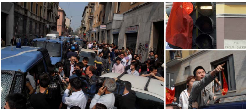
Figure 5. The urban conflict in Paolo Sarpi Street on 12 April 2007