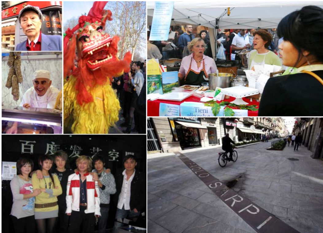
Figure 2. The urbanity of Paolo Sarpi's neighborhood