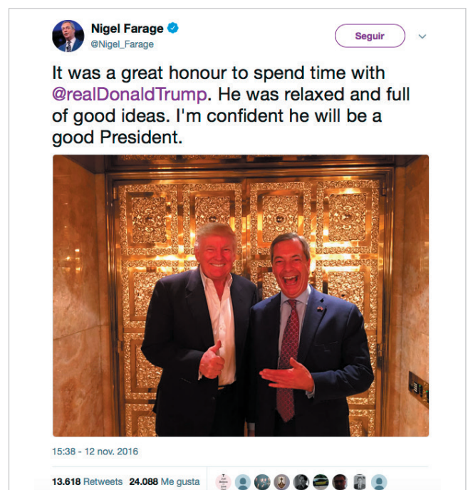
Image 2. Subjects addressed by the leaders that are of most interest to the public