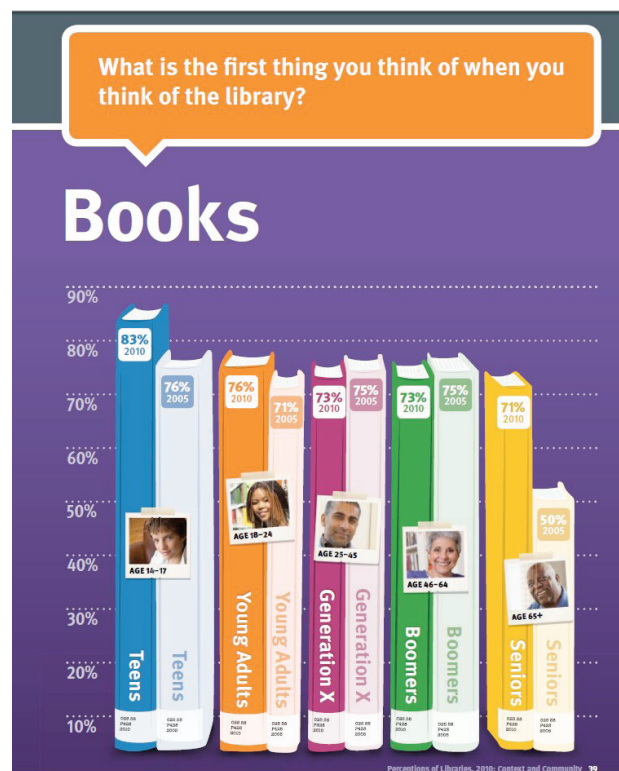
Figure 3. OCLC. Perceptions of libraries: context and community , p. 39. http://www.oclc.org/reports/2010perceptions/2010perceptions_all_singlepage.pdf

3.7% in 1984 to slightly less than 2% in 2009 (Davis, 2012). Surely, many libraries never had such a large university budget share as the ARL members, but surely they also are experiencing decreased spending as a trend.