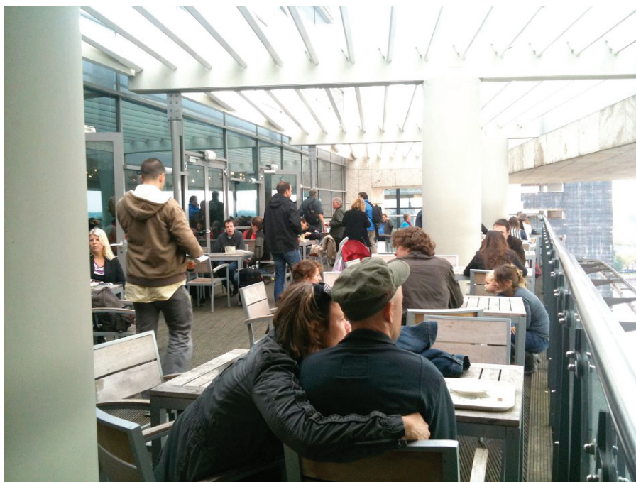
Figure 1. Less space for books and more for people (Amsterdam Public Library)

The third stage began its development between the late 20 th and early 21 st century. The digitization stage, like all others, is characterized on the one hand by a disruptive innovation (Internet) and, on the other, by the developments of the preceding stage. It is redundant and obvious to point out that the Internet has caused and still is causing major changes in the way society is organized and people interact, but perhaps it is less evident that these changes are so recent that we cannot yet know how they will be consolidated.