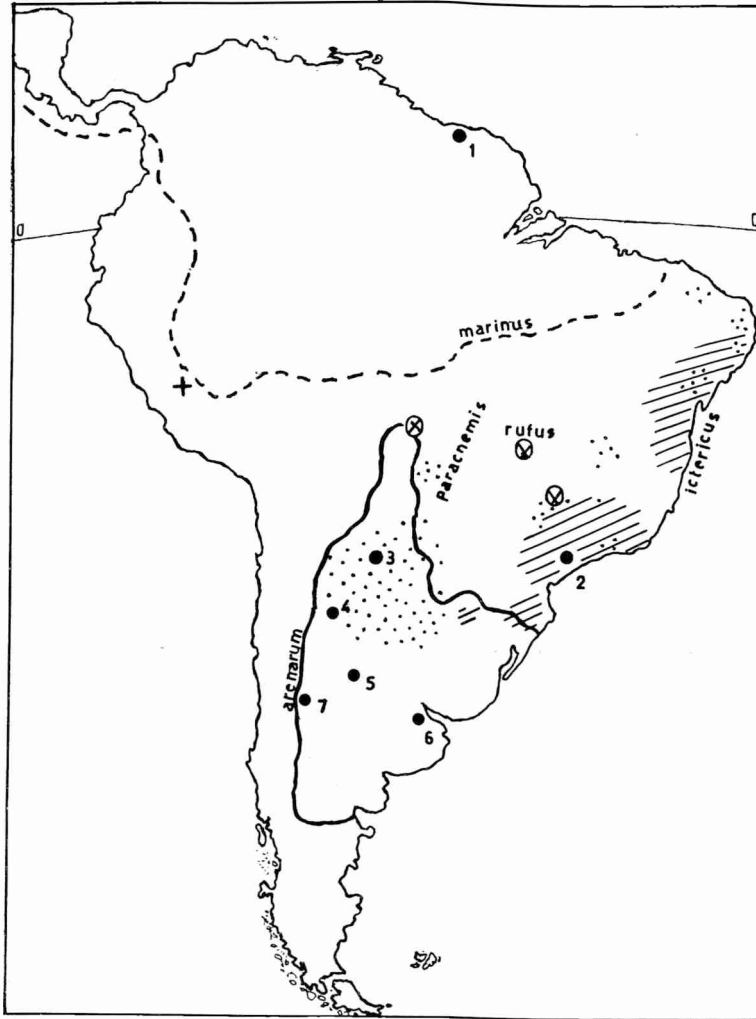
FIG. 1.—Distribution of the toads of the marinus complex in South America.

B. rufus and B. ictericus . B. ictericus is probably sympatric with B. arenarum and B. rufus (see Fig. 1).