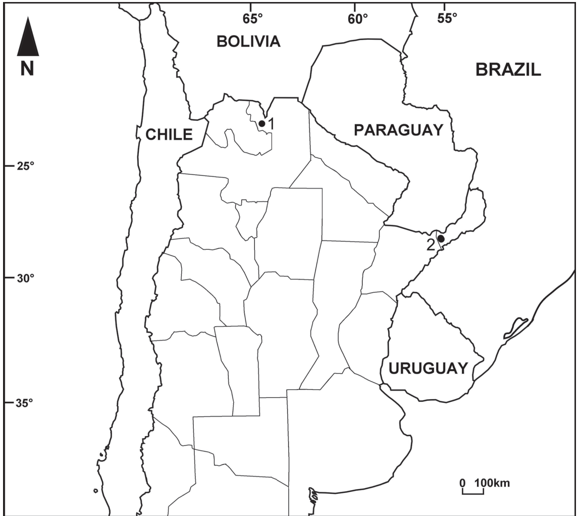
FIGURE 1: New localities in Argentina for (1) M. lavalii (Finca Alto Verde, Salta Province), and (2) M. izecksohni (Parque Provincial de la Sierra “Ing. Agrónomo Martínez-Crovetto”, Misiones Province).