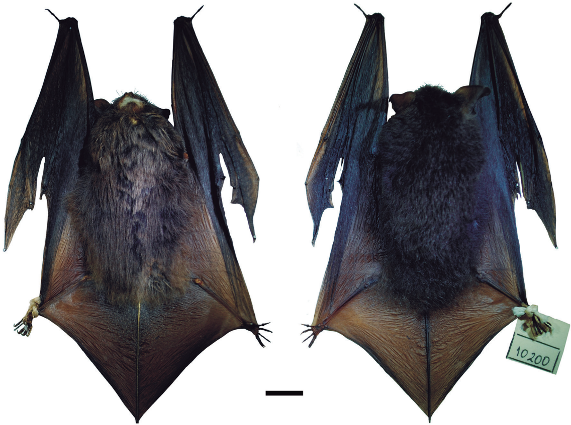
FIGURE 2: Dorsal (right) and ventral (left) view of Myotis izecksobni (CML 10200) from, Parque Provincial de la Sierra “Ing. Agrónomo Martínez-Crovetto”, Misiones, Argentina. Scale: 10 mm.

crest present, and second upper premolar not displaced to the lingual side, but generally aligned in the toothrow.