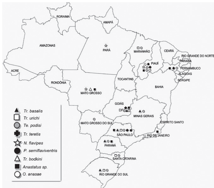
Fig. 2. Map of the known occurrence of the stink bug parasitoids Trissolcus basalis , Tr. urichi , Tr. teretis , Tr. bodkini , Telenomus podisi , Phanuropsis semiflaviventris , Neorileya flavipes , Ooencyrtus anasae , and Anastatus sp. in Brazil.