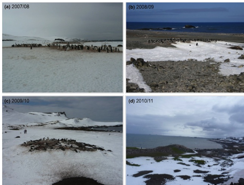
Fig. 2 Interannual comparison of local conditions recorded at the Stranger Point colony, from 2007/08 to 2010/11: (a) 2007: first week of November; (b) 2008: 10 November; (c) 2009: 5 December; (d) 2010: last week of November.

Considering the entire colony, overall breeding success remained relatively stable and high (Table 2), without any interannual differences ( \chi^2 test = 5.768, df = 3 , P = 0.155 ). However, pairs nesting in area A showed interannual variability in their breeding success ( \chi^2 test = 10.704, df = 3 , P = 0.013 ). The 2009 season had the lowest production of CS chicks (2007 vs. 2009: \chi^2 test = 8.664, df = 1 , P = 0.003 ; 2008 vs. 2009: \chi^2 test = 4.226, df = 1 , P = 0.04 ; 2009 vs. 2010: \chi^2 test = 6.088, df = 1 , P = 0.014 ). During 2009, only 27.6% of chicks reached CS, while 72.5, 56.4 and 61.2% of chicks reached it in 2007, 2008 and 2010, respectively. However, no interannual variability was observed in the success of pairs nesting in area B ( \chi^2 test = 1.16, df = 3 , P > 0.05 ). When comparing seasonal breeding success, differences between A and B groups were found only for 2009, in which the breeding success of area A pairs was significantly lower ( \chi^2 test = 5.503, df = 1 , P = 0.019 ).