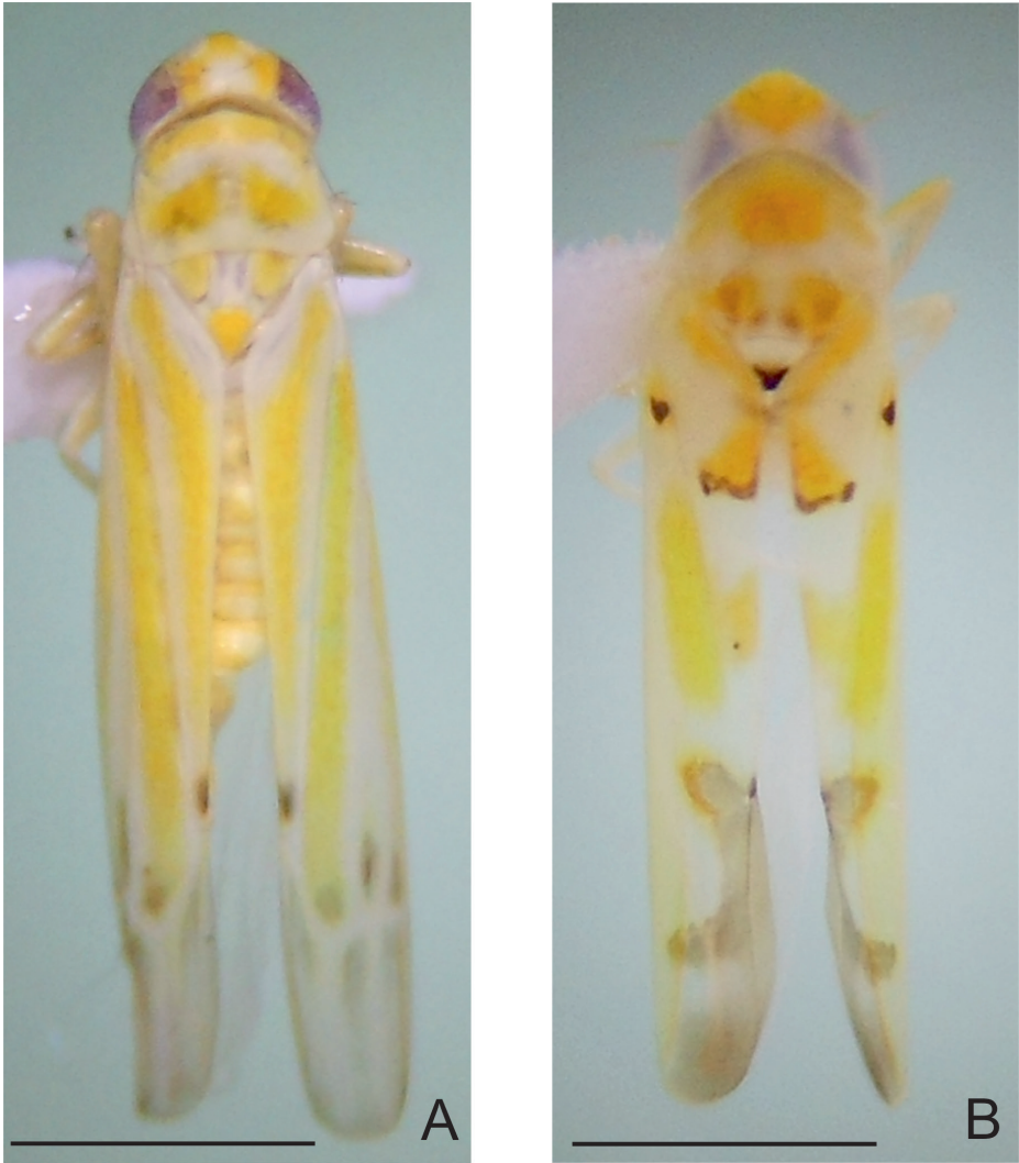
Figure 1. Dorsal habitus. A Balera floripara sp. n. B Habralebra amoena . Scale = 1 mm.

Note. This species closely resembles B. bracata but has a short process on the pygofer and the aedeagus is wider with the apical bifurcation shorter.