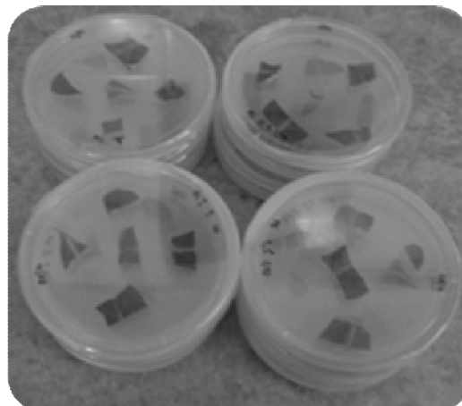
Figure 2. Foliar Sections of Phytolacca tetramera in induction medium.