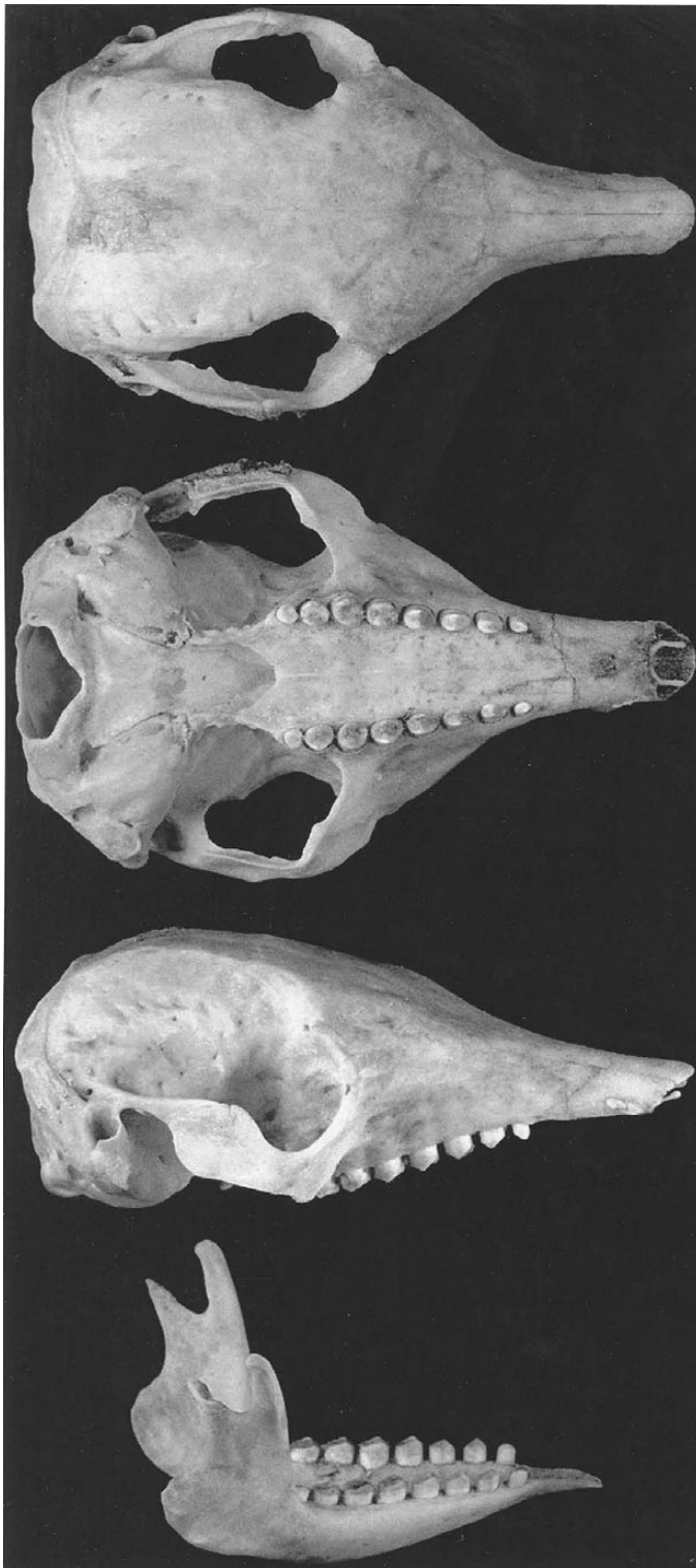
Fig. 2. —Dorsal, ventral, and lateral views of skull and lateral view of mandible of an adult male Zaedyus pichiy (MLP [Facultad de Ciencias Naturales y Museo, Universidad Nacional de La Plata, Argentina, mammal collection] 7.V.10.2) from Cerro Nevado, Malargüe, Mendoza, Argentina. Field number of specimen is ZP 43 (MS). Greatest length of skull is 62 mm.

those that subdivide the lateral figures. The posterior border of the lateral figures is thin and has small piliferous foramina, the most conspicuous foramen being located on the central figure (Vizcaino and Bargo 1993). The osteoderms of the scapular and pelvic shields are subquadratic to rectangular, with a proportionally higher number of the former than in members of Chaetophractus . The osteoderms are about 9.5 mm long and 7.5 mm wide and bear a central figure that reaches their posterior margin as well as peripheral, but no secondary figures (Fig. 3B). The central and peripheral figures are more convex than those in Chaetophractus . The osteoderms of the head shield vary in size and shape, and lack figures or perforations (Fig. 3C). The osteoderms form a pattern that is unique for each individual.