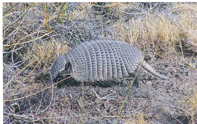
Fig. 1.—A female juvenile Zaedyus pichiy from Malargüe Department, Mendoza Province, Argentina.

[ Dasypus ] ciliatus G. Fischer, 1814:127. Type localities “ad meridiem Boni Aeris , (Buenos Ayres) inde a parallela gradus 36 latitudinis meridionalis usque ad terram Patagonum ,” junior objective synonym of Loricatus pichiy Desmarest, 1804.