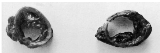
FIGURE 1. Cross sections of trachea from skua carcasses demonstrating thick, nodular, intraluminal Thelebolus microsporus mycelial mats admixed with sloughed necrotic mucosa.